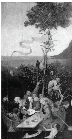
Fig. 1. Hieronymus Bosch, Ship of Fools (1490–1500)