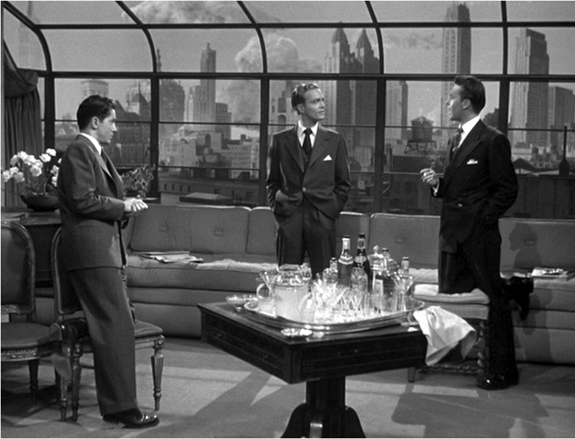
Figure 2.1. Rope . The large penthouse window and cityscape loom in the background.

the details of the cyclorama work in concert with Hitchcock's "real-time" narrative in order to follow Brandon and Phillip's command of space and concealment of the secret.