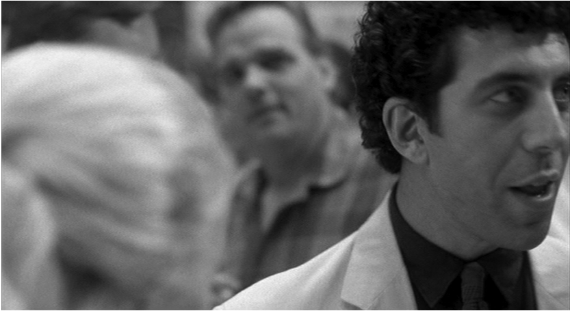
Figure 5.2. Talk Radio . Fan or threatening figure? Barry under surveillance.

visual information. After the woman argues with Barry, she throws her drink on him, subtly demonstrating his vulnerability in the public sphere. The scene climaxes when Barry is introduced at the podium, as the crowd becomes rowdy. Barry tries to speak, but is drowned out by boos and shouting from the crowd. The importance of the basketball sequence is not only that it grants listeners the opportunity to meet Barry, but also lies in the juxtaposition between the confined setting of WGAB and the sea of surveilling eyes at the basketball game, which underscores that Barry has many enemies as well as fans. Moreover, the scene illustrates the importance of foreground and background planes that establish Talk Radio's mise-en-scène of paranoia. Although the basketball space far exceeds the small space of WGAB, Stone still effectively confines Barry through tight framing and predominantly keeping the background plane in soft focus. The close framing and soft-focus background of the crowd at the basketball game prevent viewers from obtaining visual mastery, thereby reflecting Barry's public vulnerability due to his perverse, aggressive enjoyment as a shock jock.