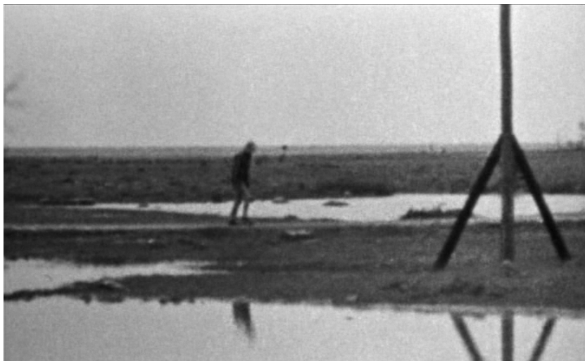
Figure 3.1. The Passion of Anna . The boundary between reality and the real begins to collapse.

falls to the ground as the grain of the film literally disintegrates him. The sound of timpani is heard, evoking the dead horse. As the film ends, the narrator states: “This time they called him Andreas Winkleman.”