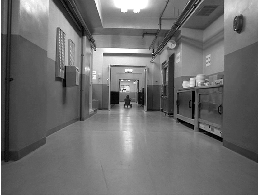
Figure 4.2. The Shining . The camera lingers far behind Danny to suggest something frighteningly unknowable.

states, "Point-of-view structure depends on there being no total view, no transcendental position from which an all would, if only in principle, come into view." 23 Kubrick's expressionistic movement of the Steadicam, wide-angle framing, and sinister soundtrack manifest the excess of the gaze. At the same time, the unattributable bearer of the look suggests the presence of others that exist in the Overlook. Danny's ability to manifest the past confirms what lurks in the corridors and may not just be his imagination. As I will explain in the final section of this chapter, exploring the reverse-angle shot offers a potential clue to uncovering the Overlook's ghostly dimension.