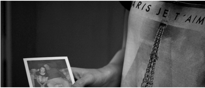
Figure 7.1. 10 Cloverfield Lane . Michelle wears the same shirt as Brittany in the photo.