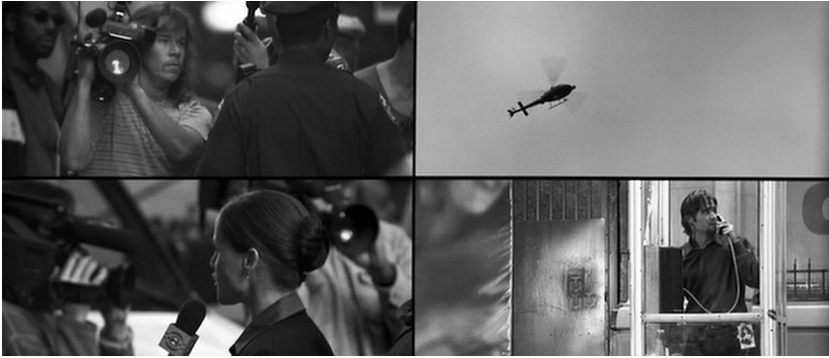
Figure 6.1. Phone Booth . Simultaneous information renders the gaze as a distorting presence.

Caller's knowledge, such as when Stu covertly dials Kelly while talking to the Caller. Kelly's image appears in a split screen as she answers her cell phone. Hearing Stu's conversation with the Caller, she now knows that he is being held hostage by a sniper. Kelly brings her phone to Ramey, which significantly changes the narrative.