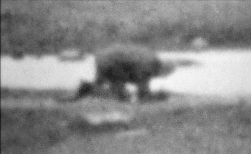
Figure 3.2. The Passion of Anna . Andreas disintegrates.

the zoom in The Passion of Anna finds its object: Andreas. Whereas the flash frame at the end of Wavelength reminds viewers of cinema's secret (the still frame), Bergman reminds viewers of The Passion of Anna's subject: "This time they called him Andreas Winkleman." At the same time, the sound of the ticking clock during the zoom shot and the reference to Andreas's name gestures to the start of the film, suggesting a looping narrative that intimately connects to cinema's still frame flickering over and over into infinity.