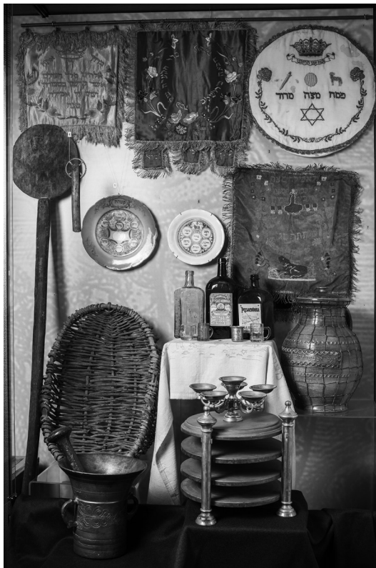
Figure 2a The Museum of Jewish History in Russia.