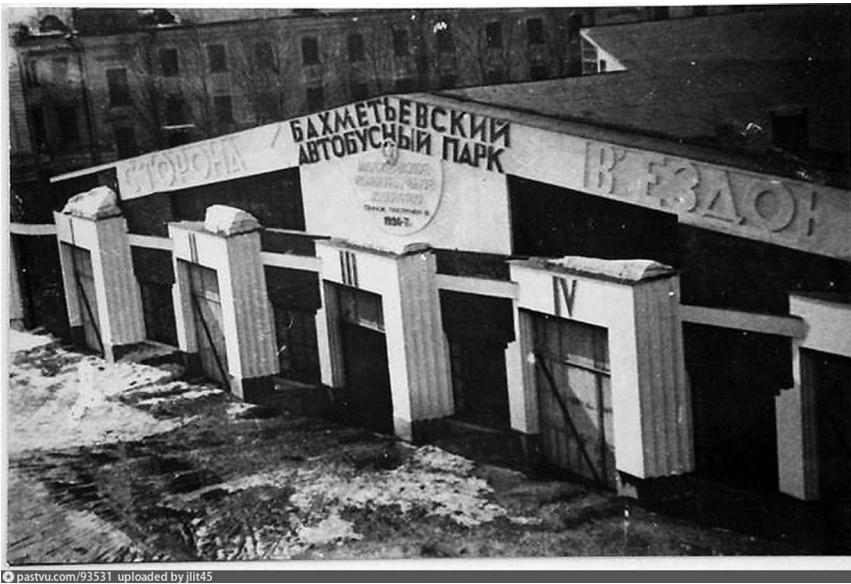
Figure 4 The Bakhmetevskii bus depot, before reconstruction.