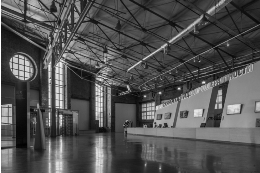
Figure 8 The Bakhmetevskii bus depot, after reconstruction. The museum interior.

Vekselberg, Len Blavatnik, Roman Abramovich, and others contributed to the project. 19