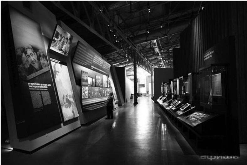
Figure 10 The unveiling of the JMTC, November 11, 2012.