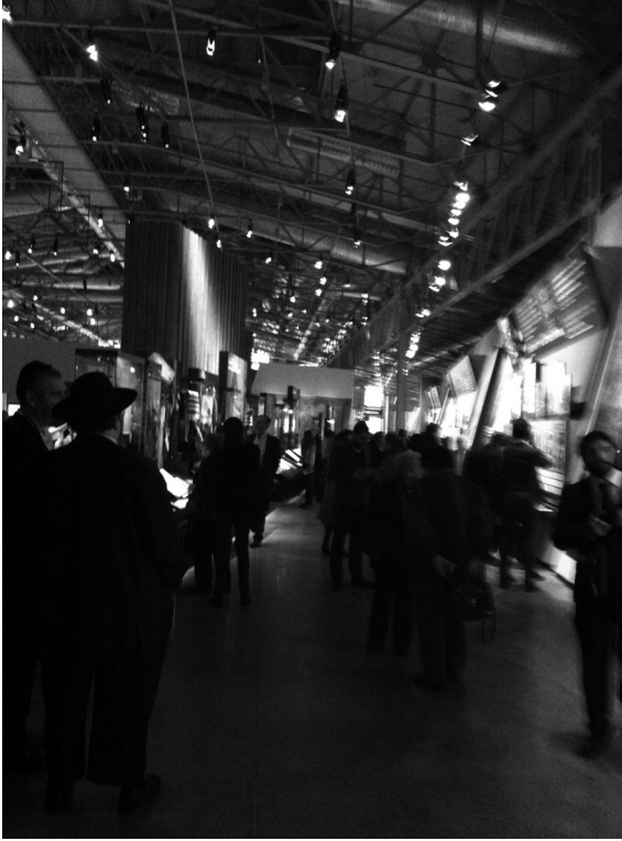
Figure 9 The unveiling of the JMTC, November 11, 2012.