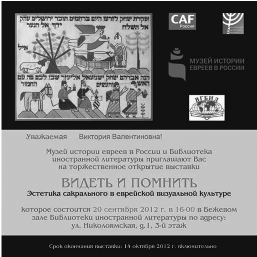
Figure 16 Poster of the exhibition “To See and to Remember”.

theater was held. Six sections covered the eras from the “renaissance of Jewish culture” (the end of the nineteenth/start of the twentieth centuries) to the sad end of its theatrical age. 31 Another example—the exhibition “Good Luck in the New Year! Jewish Autumn Holidays in Decorative Art from the Collections of the Museum of Jewish History in Russia” (September 4–September 30, 2013)