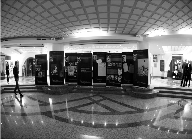
Figure 1b The Museum of Jewish Heritage and Holocaust, interior view.