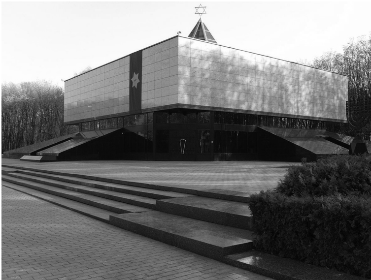
Figure 1a The Museum of Jewish Heritage and Holocaust at Poklonnaia Gora. The building houses the memorial synagogue and the museum.

It was on this historic site that a Jewish memorial was erected (figures nos. 1a and 1b).