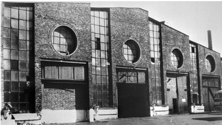
Figure 5 The Bakhmetevskii bus depot, before reconstruction.

The restoration work was undertaken by the Iris Foundation for development and supporting the arts, established by Daria Zhukova, who is a board member of the JMTC foundation. Starting in 2008, the Garage Center for Contemporary Culture operated for a few years in the refurbished building. At the same time an international competition was held to suggest