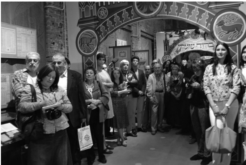
Figure 18 At the exhibition “Good Luck in the New Year!”

Internal cooperation between the Jewish museums, as well as external cooperation with other cultural institutions, including those abroad, appears to be a highly positive factor that enriches the activities of each