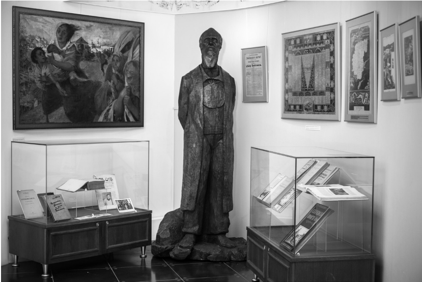
Figure 2b The Museum of Jewish History in Russia. Display devoted to Beilis affair.