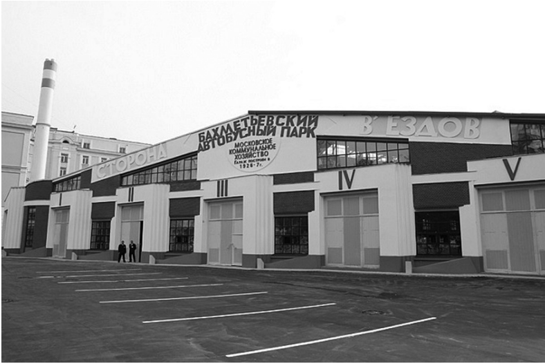
Figure 6 The Bakhmetevskii bus depot, after reconstruction.