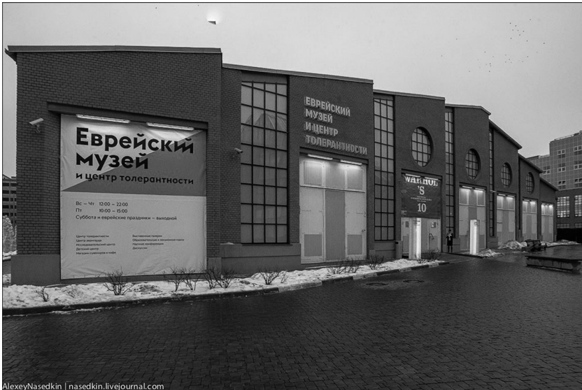
Figure 7 The Bakhmetevskii bus depot, after reconstruction.

ideas about converting the building, with a view to installing a contemporary arts museum and cultural center. The originators of the museum concept decided that Ralph Appelbaum Associates, which for years had been planning the JMTC exhibition, would be the lead contractor. Victor