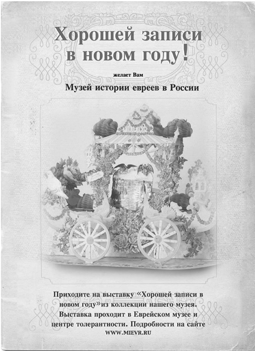
Figure 17 Poster of the exhibition "Good Luck in the New Year!".

held at the JMTC, displaying exhibits, most of which had never been shown before in Russia or abroad (figures nos. 17–18). 32