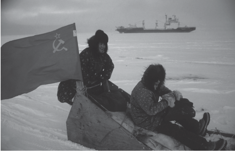
Figure 1 North Slope (USA) villagers passing a Soviet icebreaker, flying a Soviet flag in 1988.

‘Operation Breakthrough’ received high levels of media attention and was also the object of critique from those who found the use of resources disproportionate to the likelihood of successful survival for the whales or the importance of the effort (Archer, 1988).