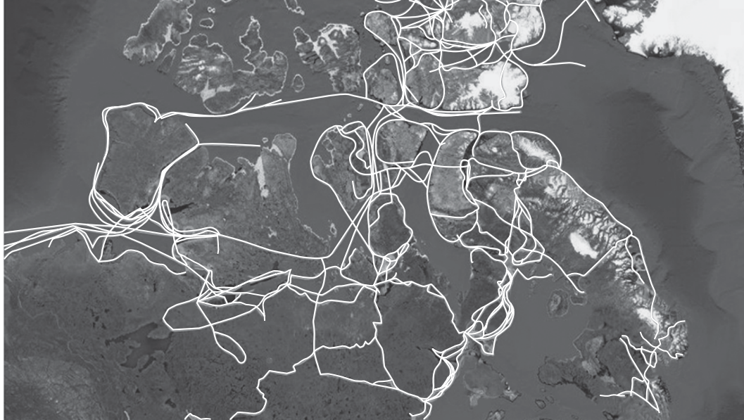
Figure 6 Map of a use-based demarcation of the Arctic from the Pan Inuit Trails project.