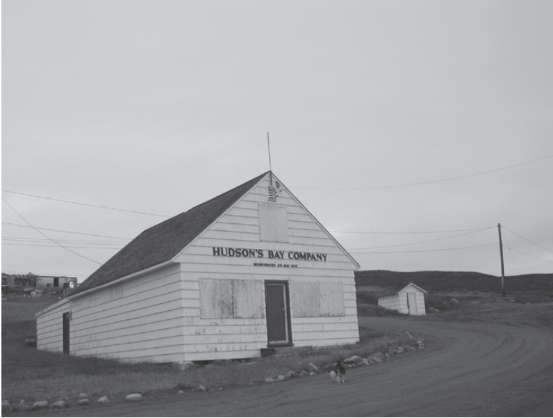
Figure 3 Hudson's Bay Company Building in Apex, Iqaluit, Nunavut.

Companies became an especially prominent feature of the Soviet and now Russian (again) Arctic. Industry and exploitation of the Arctic's natural resources were seen as important pursuits in Stalin's 'revolution from above' to promote Soviet economic independence and prosperity (Rowe, 2013; Bruno, 2016). Mining and metallurgy became key parts of this from the 1950s onwards, followed by an oil-and-gas era in Siberia from the 1970s. The Russian Arctic is highly urbanised – an anomaly in the otherwise small-community Arctic landscape. These towns are 'one-industry' cities ( monogorody ) with industries that typically took responsibility for education, community health, pensioner travel, and support and accommodation. While these State–business relations have been rapidly changing in the post-Soviet Arctic, the companies remain the touchstone for how corporate citizenship and environmental and social responsibility of new companies are assessed (Kelman et al. , 2016; Wilson Rowe, 2017b).