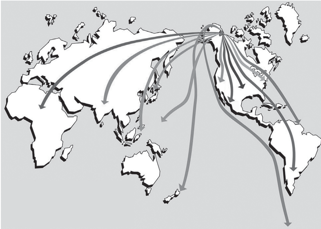
Figure 4 Map of global migration routes of birds with nesting grounds in Alaska's Arctic National Wildlife Refuge.