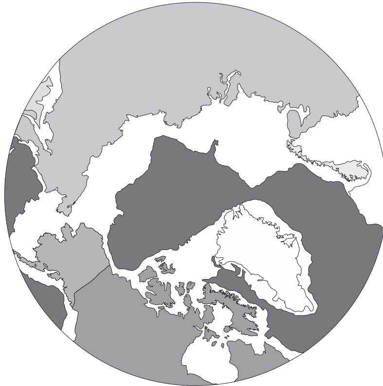
Figure 5 Map of North Circumpolar Region (polar projection).