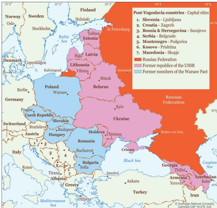
Map 1: Russia and its western neighbours.