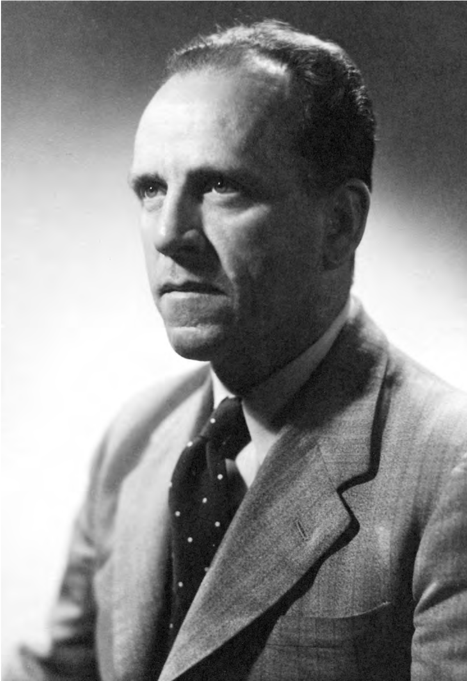
Dr H.C. (Nugget) Coombs, 1950