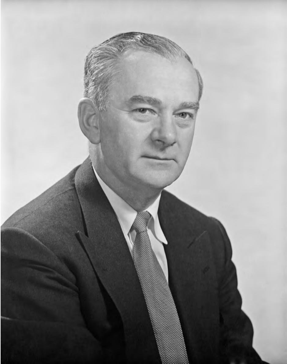
Sir Allen Brown, 1958