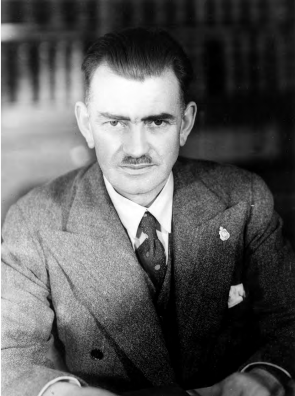
John Dedman, 1941