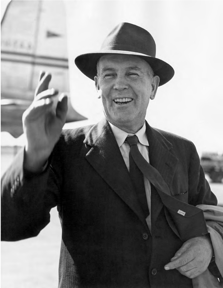
J.B. (Ben) Chifley, c1949