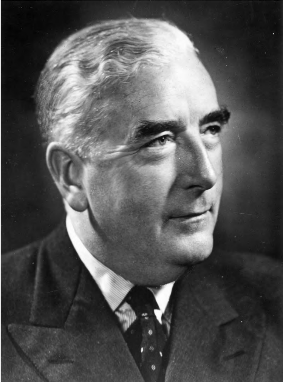
Robert Menzies, c1950