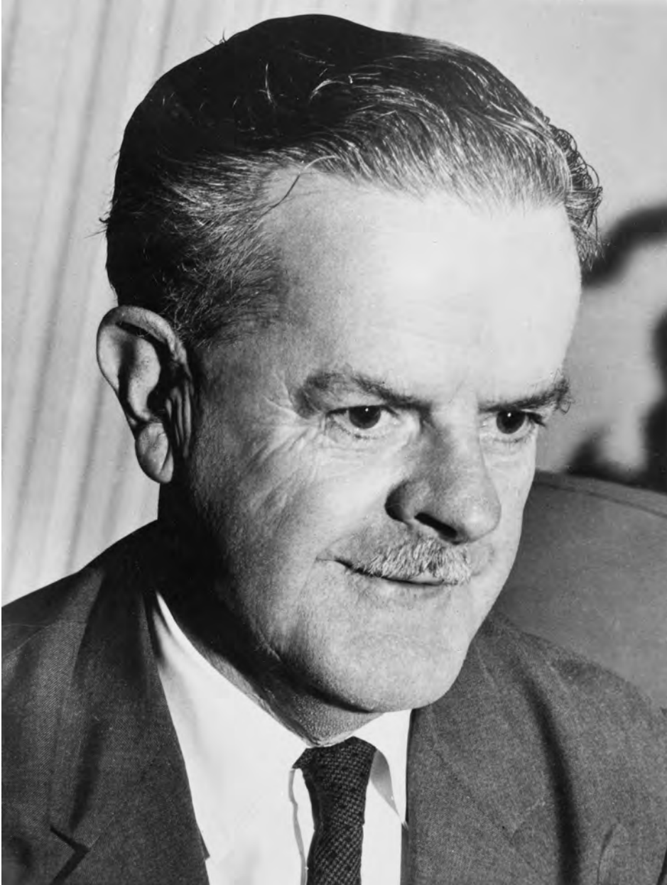
Sir John Crawford, 1967

year as Director of Research in the Department of Post-War Reconstruction. In 1945 he became founding director of the Bureau of Agricultural Economics (BAE), which was transferred to the Department of Commerce and Agriculture in 1946.