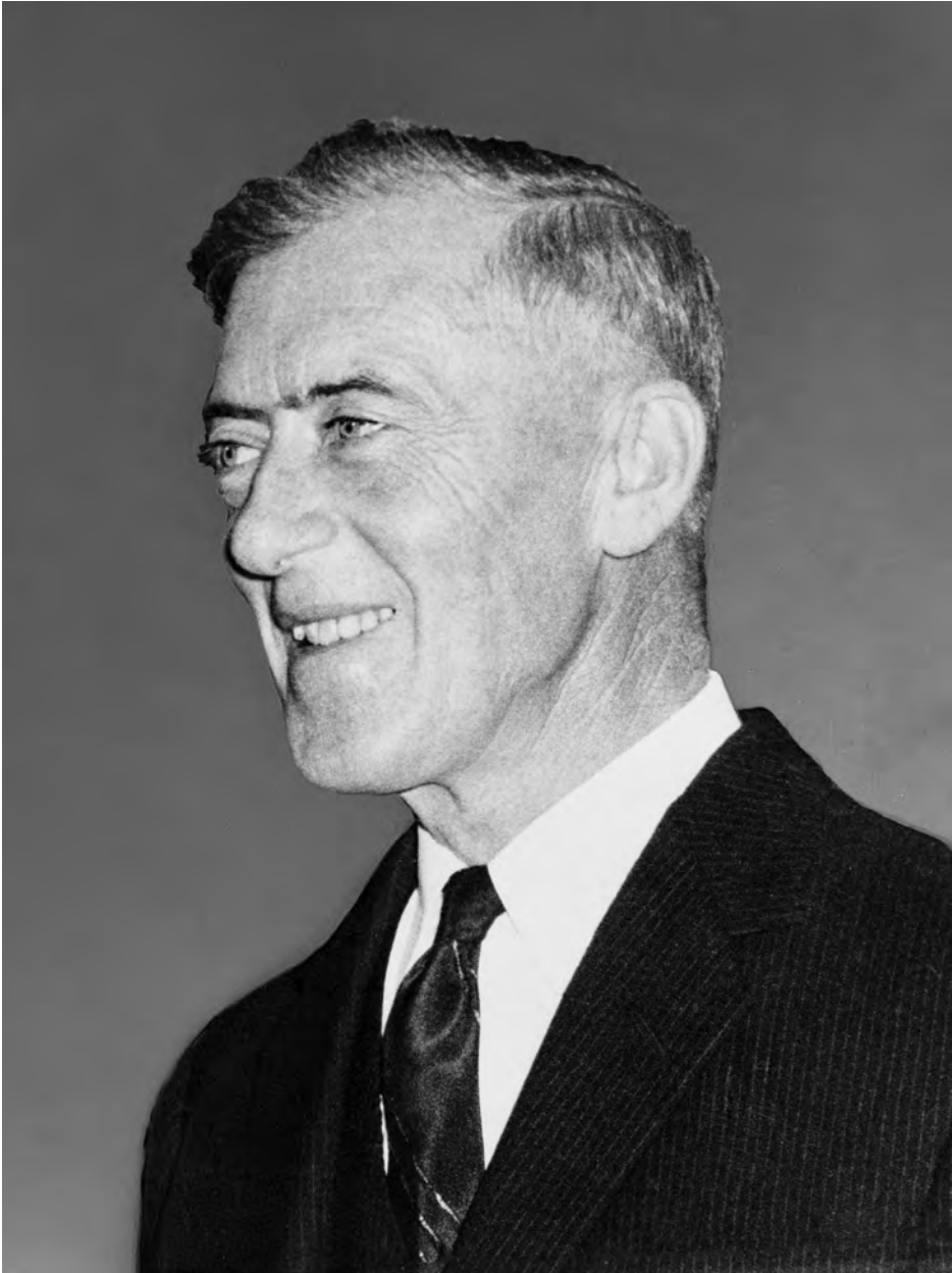
Sir Roland Wilson, 1965