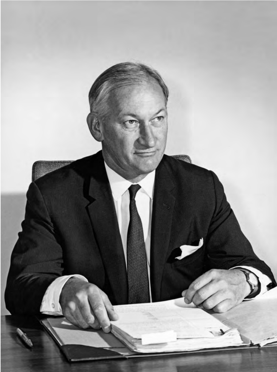
Sir Arthur Tange, 1965

Source: National Archives of Australia, A8947, 45