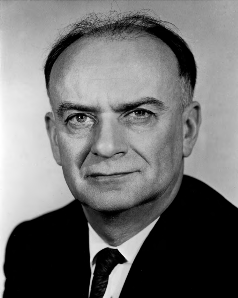
Sir Henry Bland, 1966