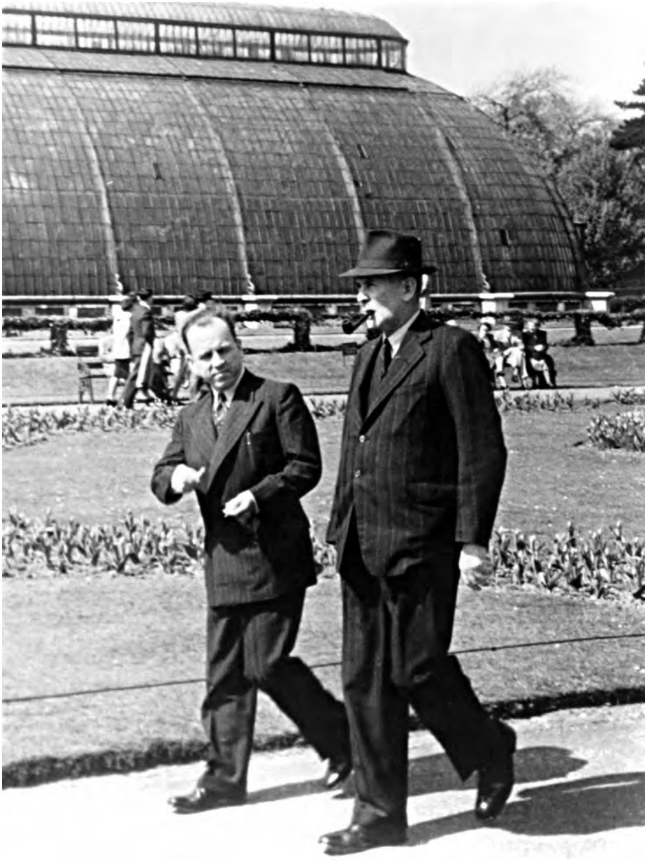
H.C. Coombs with Prime Minister Ben Chifley in London, 1946