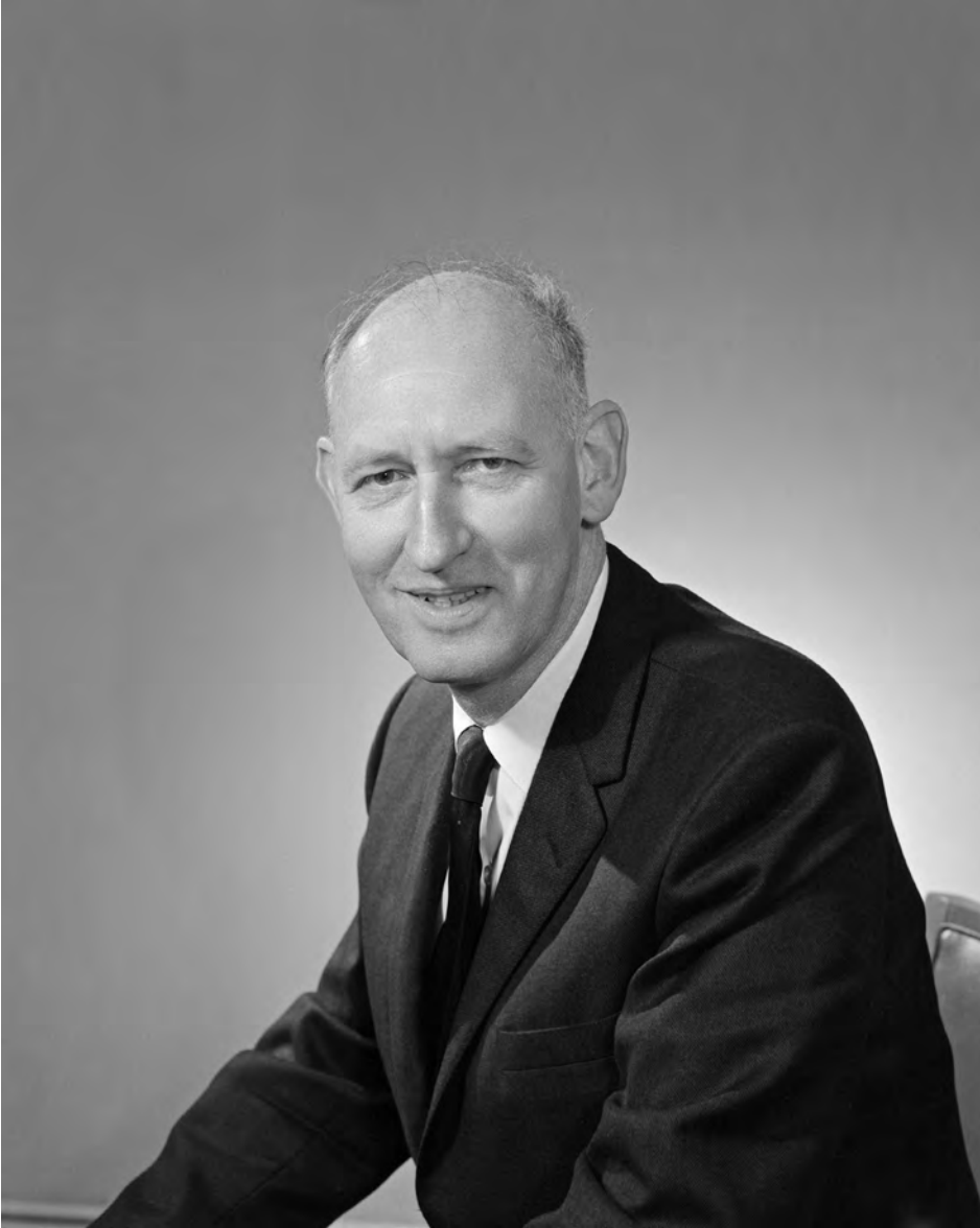
Sir James Plimsoll, 1965