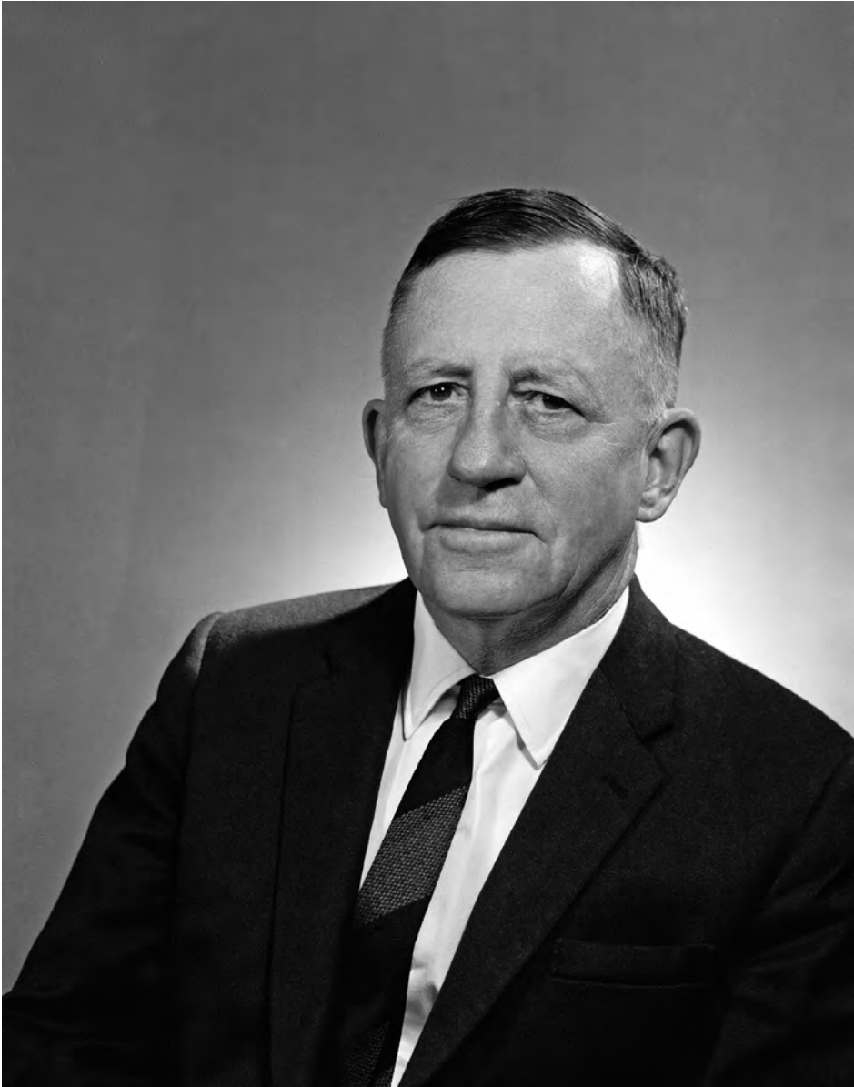
Sir Richard Randall, 1966