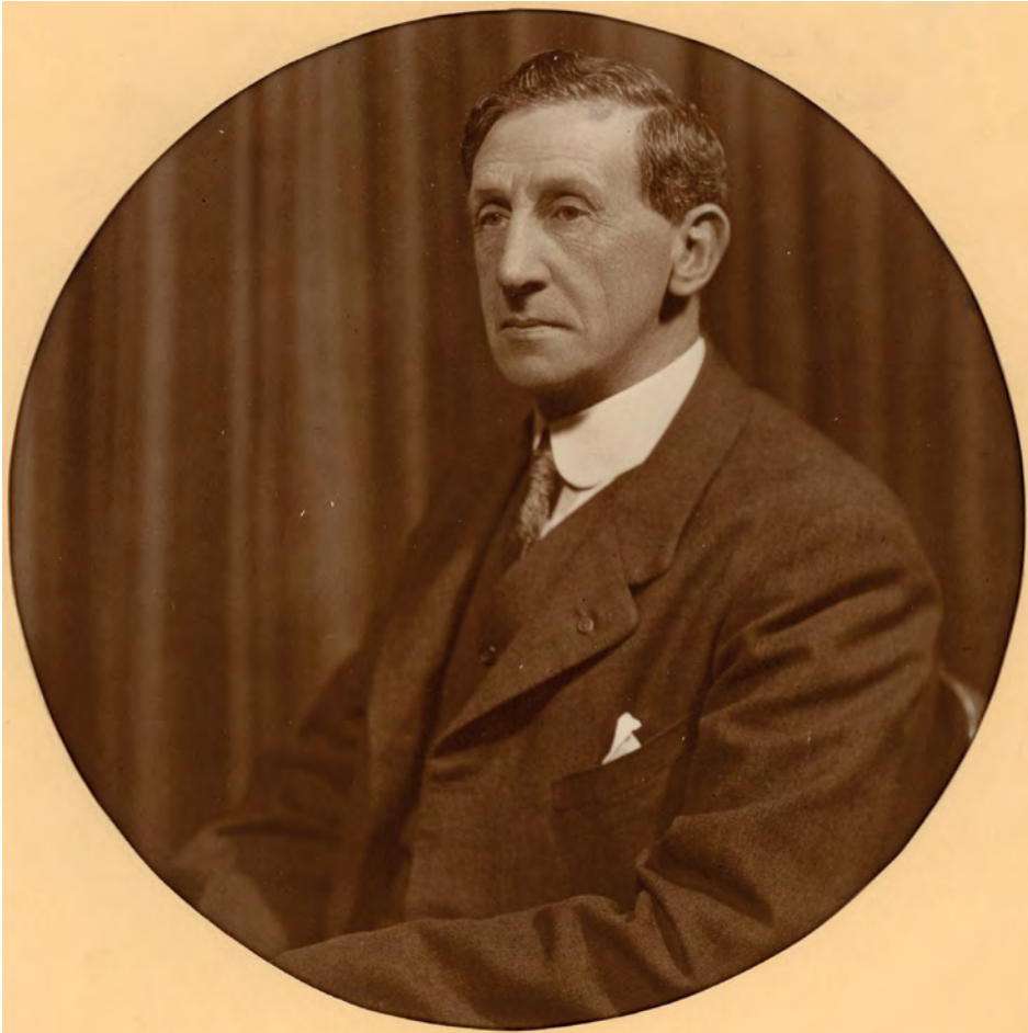
Sir Robert Garran, c1930

in 1932, however, he left a public service hostile to graduates except those with professional degrees, mainly law, engineering and medicine. It was also a public service in which the road to the top largely began at the bottom.