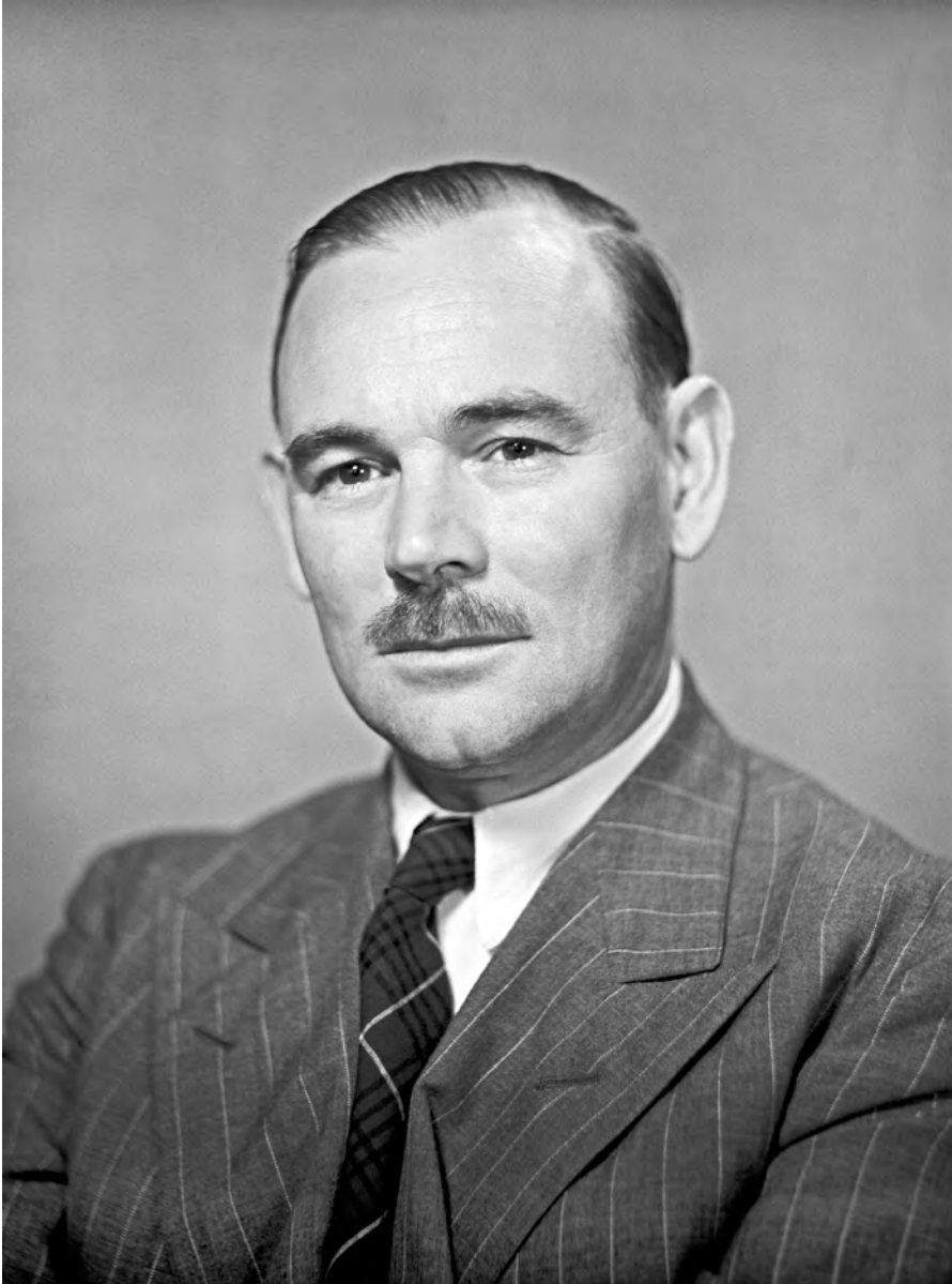
Paul Hasluck, 1954

Pacific but need not be provoked unnecessarily. Here he differed from Evatt in tone rather than substance. Hasluck was already aware that, in an international community shaped first and foremost by power relationships, Australia must use judgment in achieving effect while working within its limitations.