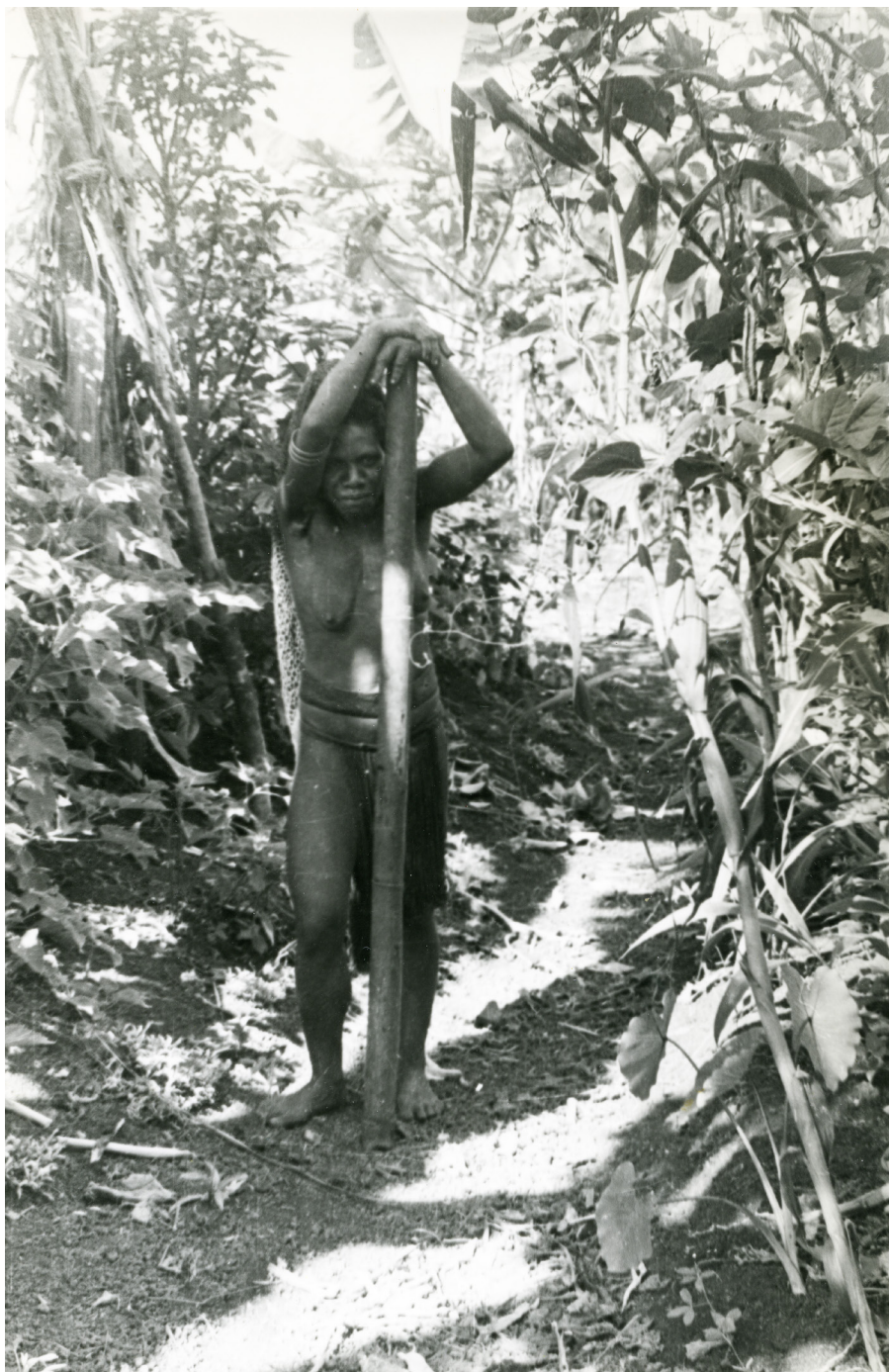
Photograph 11: Woman in garden