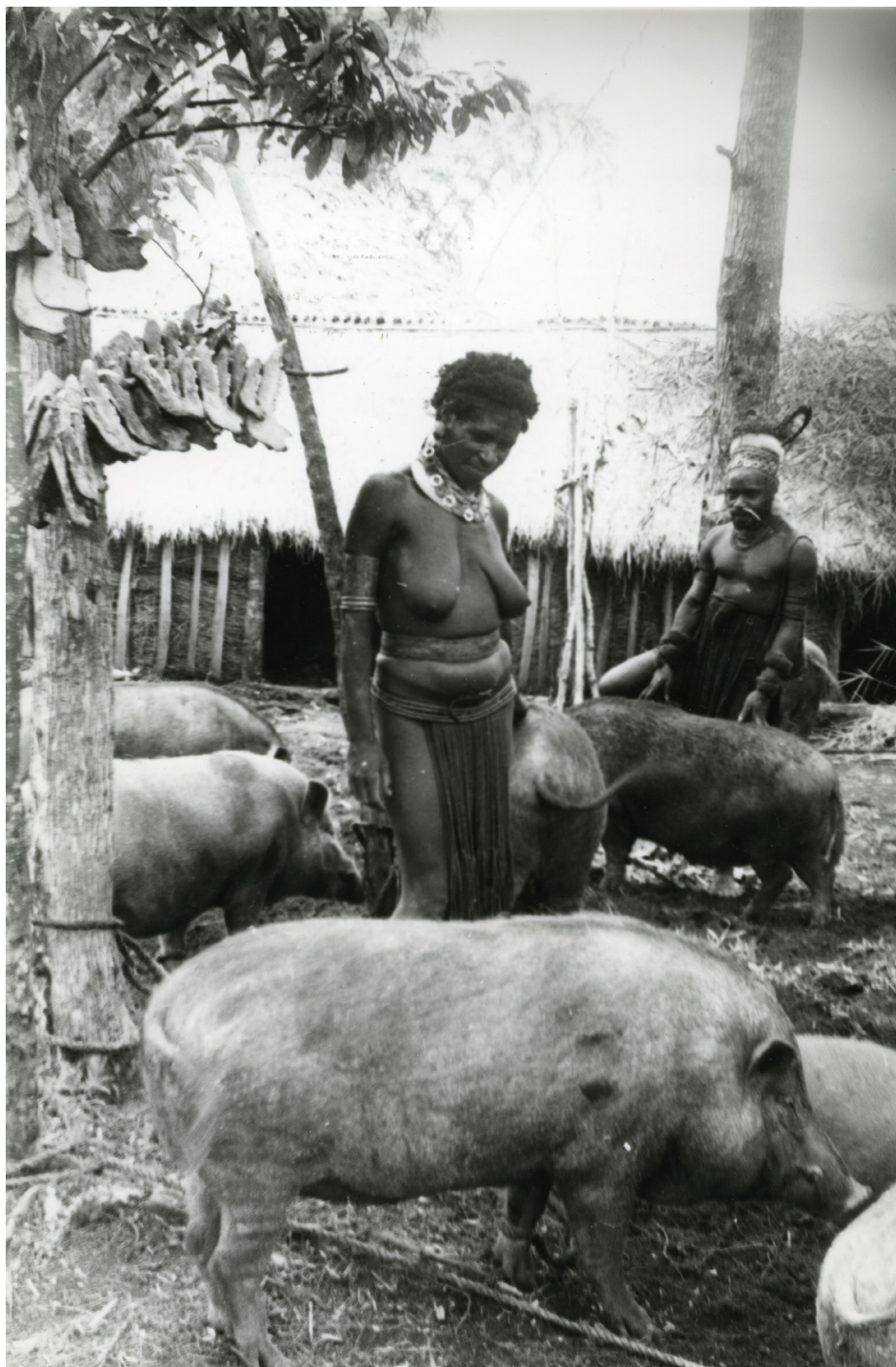
Photograph 9: Woman and pigs