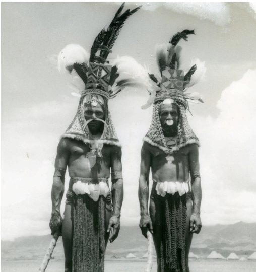
Photograph 15: Men wearing spirit boards