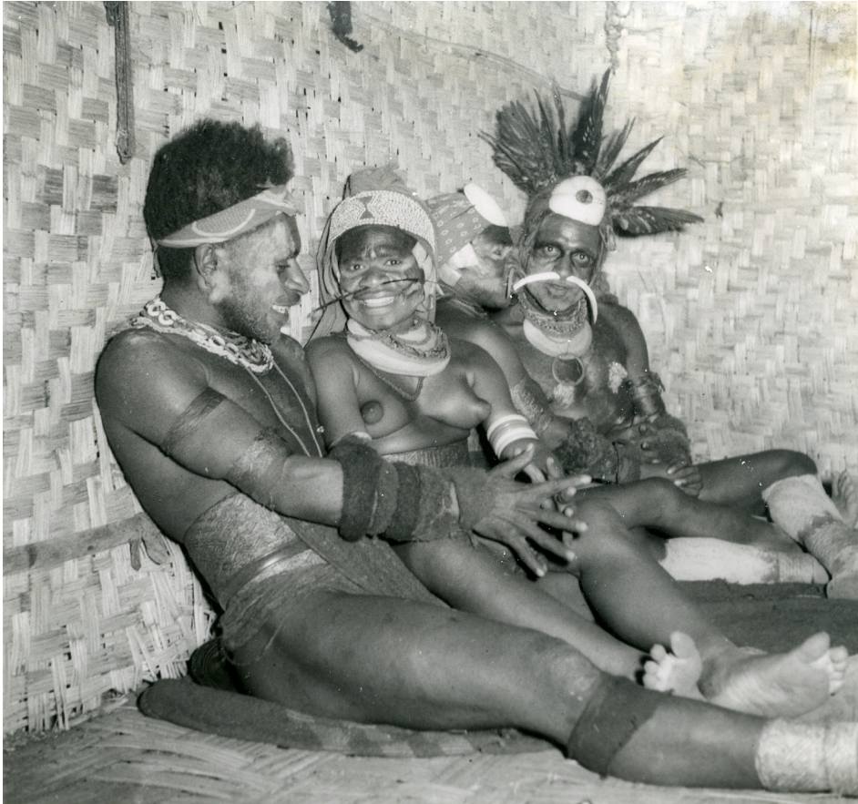
Photograph 4: Karim leg (carrying leg) II