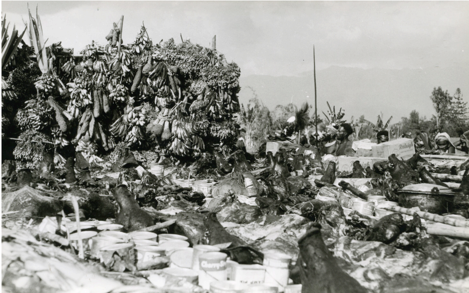
Photograph 12: Pig feast