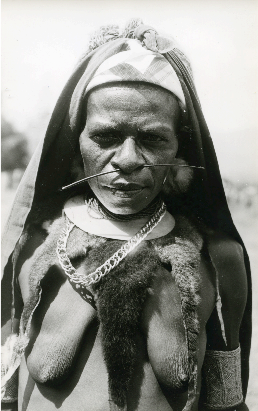
Photograph 7: Wahgi married woman