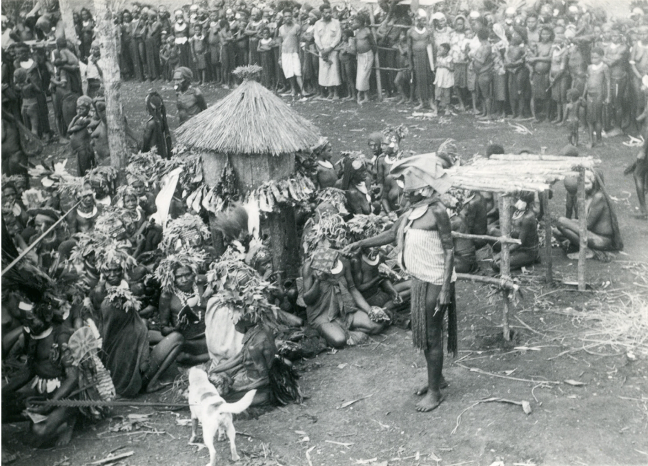
Photograph 14: Feast with possible cult house