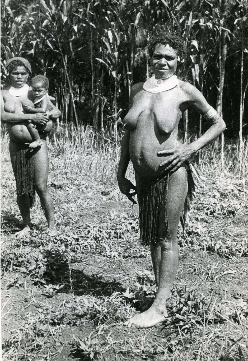
Photograph 10: Two women and child