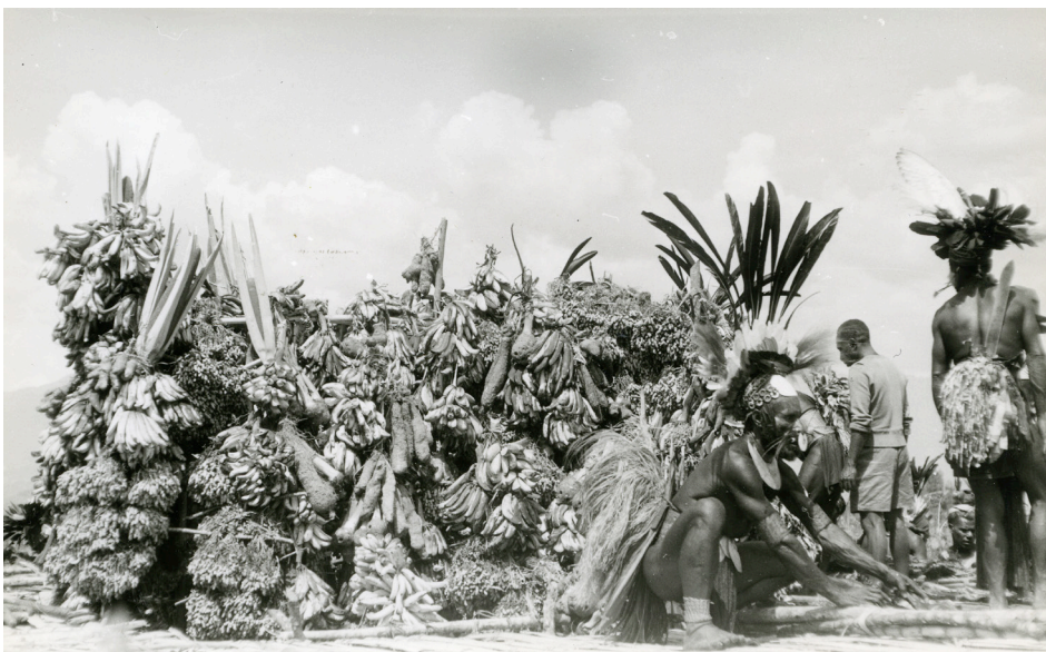
Photograph 13: Wubalt festival (harvest feast featuring pandanus nuts)