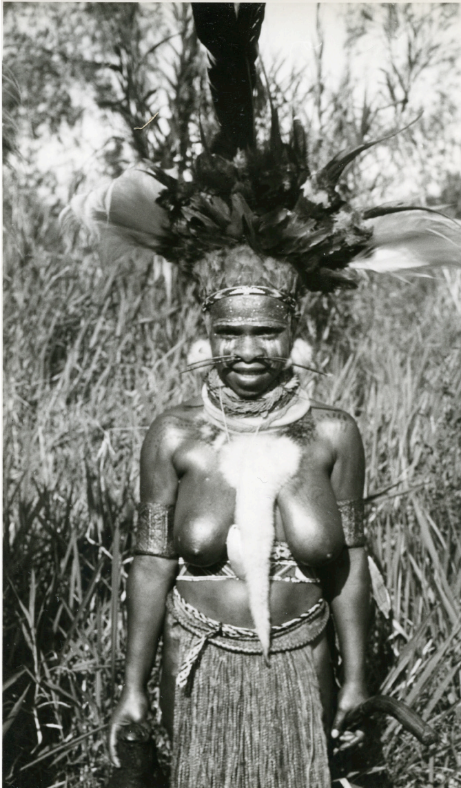
Photograph 6: Girl bathed in pig grease

episodes recorded from life here in which husbands capture their 'wayward' wives, lock them into the house, subjugate them with sexual and other physical violence, exercise male dominance and privilege. But wives resist, display physical courage, readiness to defend themselves as well as to attack and to fight with men—and also display anger and resignation on occasions when they can do no more.