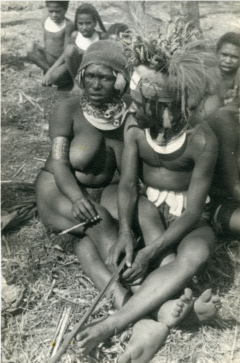
Photograph 3: Karim leg (carrying leg) I—Kuma 1959

flattered to be chosen as courting partners. Reay's photo collection also shows couples engaging in tanim het , in which couples sit close, turning their heads and pressing noses and faces together.