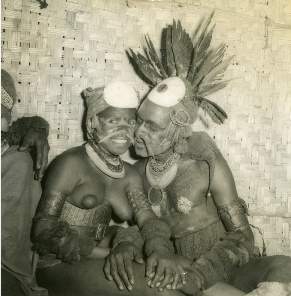
Photograph 5: Tanimhet