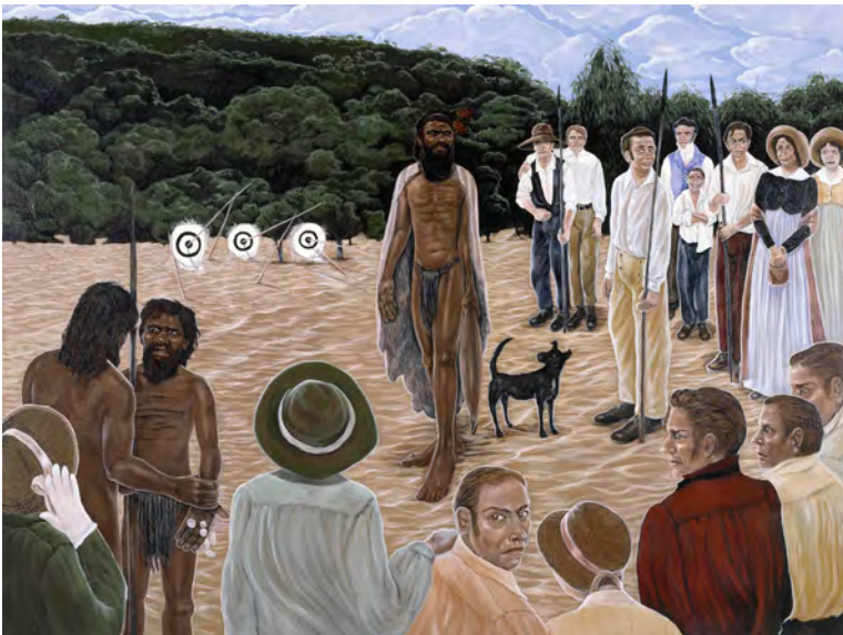
'Yagan', Julie Dowling (2006).