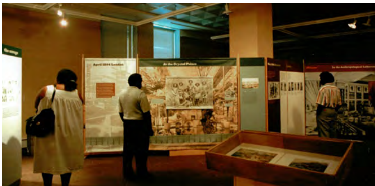
The Palm Island delegates visiting the Captive Lives exhibition.