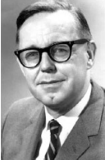
Figure 7.1. John Clive Ward, an eminent figure in physics at Macquarie

John Ward was a Fellow of the Royal Society of London and the recipient of several prestigious medals and prizes across his career. His originality and ability to ‘find his way through complicated systems with many degrees of freedom’, as his obituarists described it, ‘resulted in fundamental contributions in quantum electrodynamics, elementary particle physics, quantum solid-state physics, and quantum statistics.’