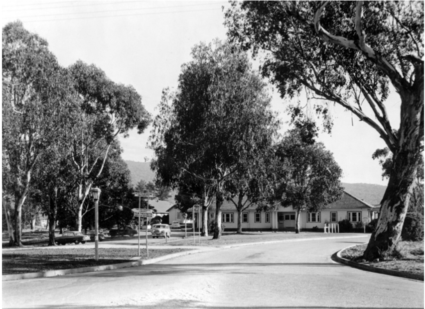
Figure 5.1. The young Australian National University in 1958 where staff, recruited across many disciplines, mixed in the temporary structure of the 'Old Hospital Building' seen here