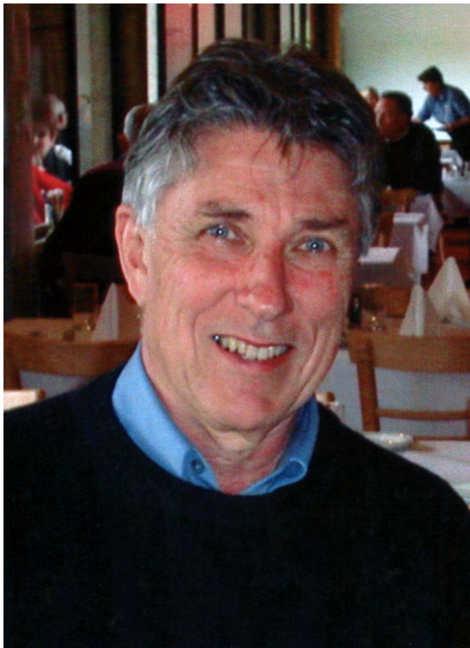
Alan McIntosh Private collection

Importantly, scattered among the older galaxy of stars was a remarkable cluster of young Australian researchers and lecturers who would go on to forge outstanding reputations. In mathematics they included the