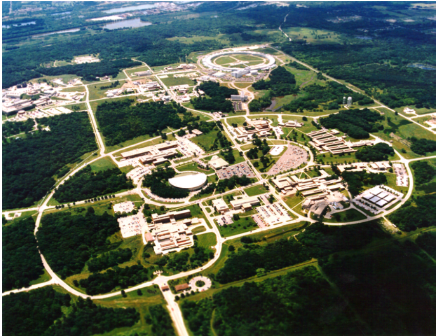
Figure 6.1. Argonne National Laboratory, America's leading National Atomic Energy Laboratory for peaceful purposes. Deer played in its spacious parks