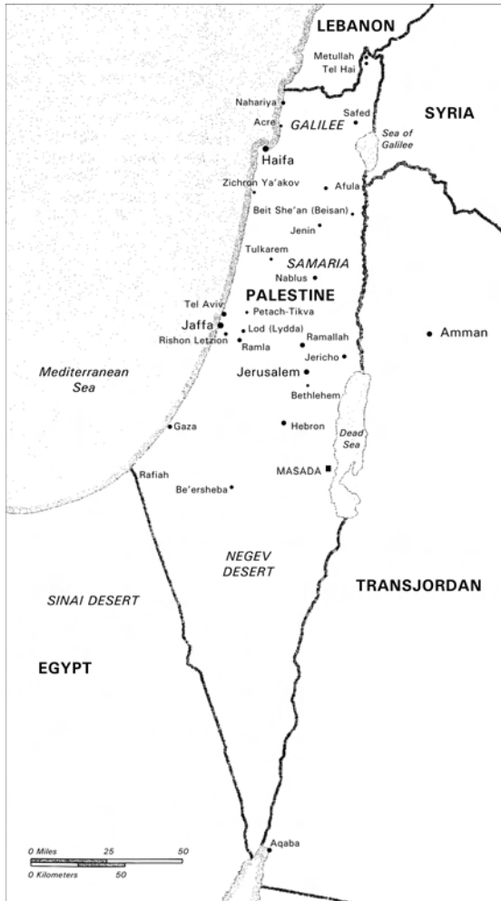
Figure 1.1. Palestine under the British Mandate 1922–1948