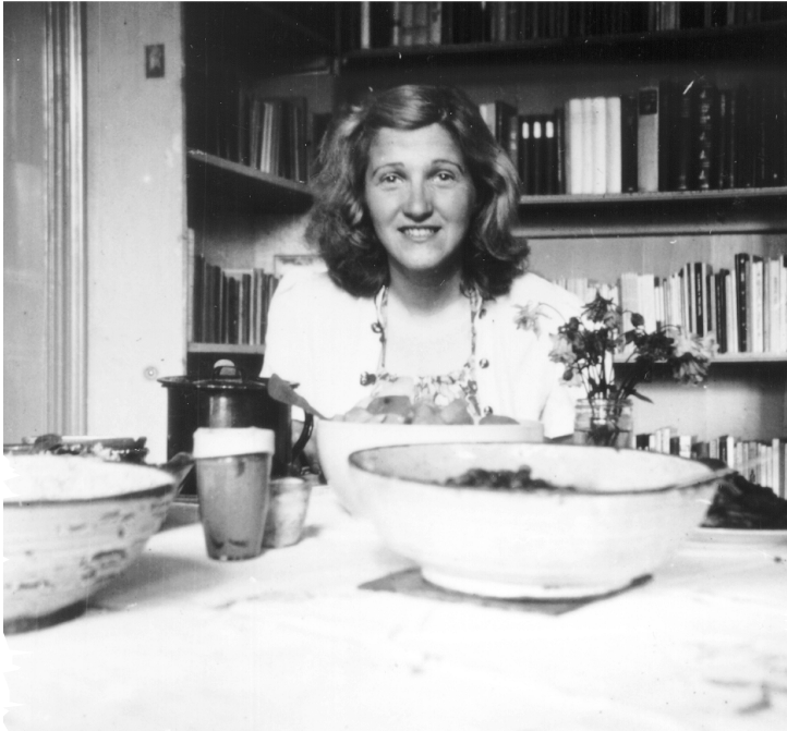
4. Marga Minco, hair bleached, in hiding (ca. 1943).

While Marga Minco's De glazen brug , published in 1986, shows striking thematic similarities to The Assault , any discussion of the text or its context must begin with one major difference – that of viewing the memory of the occupation from the perspective of Jewish subjects. In some sense, nearly all of Minco's works from 1957 to the present deal thematically with the occupation and its consequences for post-war