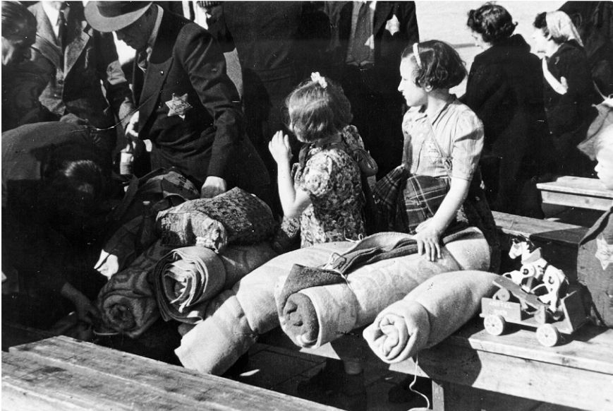
5. Jewish children being deported.