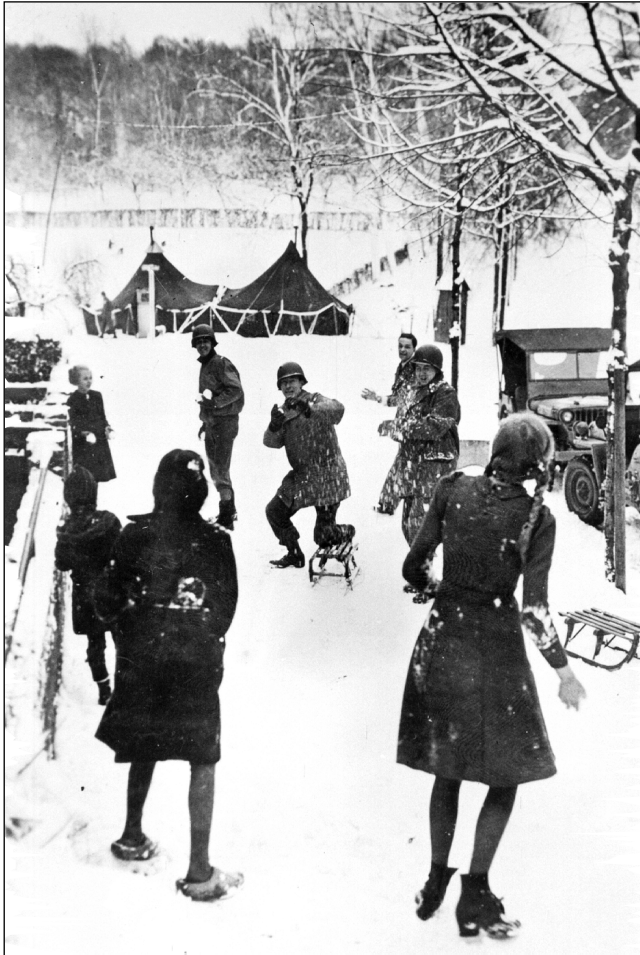
12. Dutch children enjoying a snowball fight with U.S. officers.

And there are people who did not experience the war because they were born after the war had ended. There are more and more of that sort. They have to