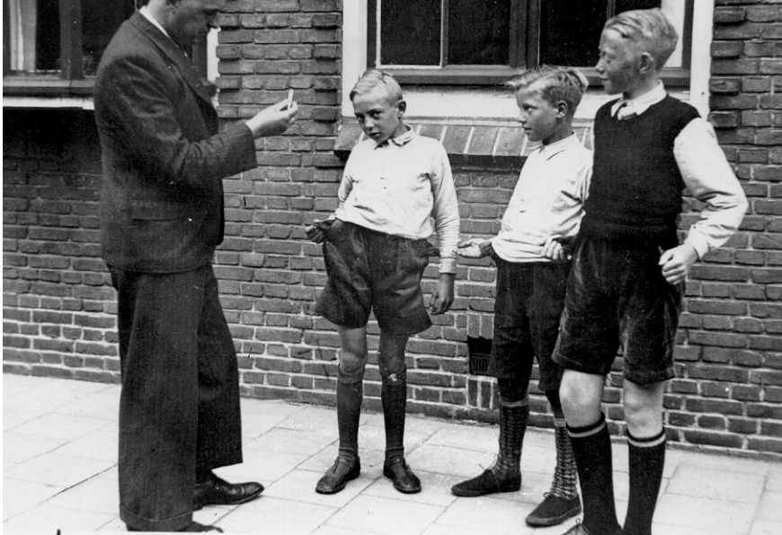
11. School yard: a teacher checks to see if children are carrying around any shells they may have found (1940).

Historical accounts of the days following the German attack concur with this description. Upon capitulation, it was to the advantage of Dutch soldiers to change into civilian clothes and head home. If the Dutch soldiers are only soldiers because of what they are wearing, that fact raises crucial issues about identity for the young boys who are participating in or listening to these discussions. Could the boys become soldiers by wearing different clothing? Does that mean that they could behave like military personnel: behave in a brave manner, have authority over others, and perhaps kill someone? In raising these questions, the narrator prepares the reader for passages later on where such issues are more explicitly identified as central to the development of the (male) psyche of survivors of the occupation.