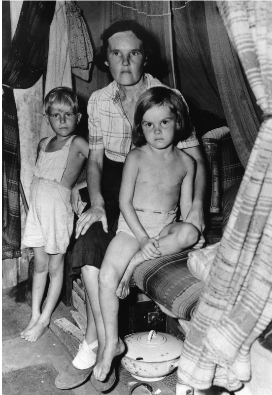
18. A mother and two children at Tjideng camp, Batavia, Java.

In addition, the protagonist's "misconnected" relationship with his mother is also represented as related to his violent fantasies about his (female) lovers, an effect which may on the surface seem extreme. Aesthetically speaking, this repetition is another instance of " octaviteit ." On the other hand, an ICODO study on the experiences of young boys interned in Japanese camps offers evidence of possible developmental reasons for such reactions from the psychological point of view. If this is correct, the feelings and responses represented in Sunken Red are not nearly as extreme or exaggerated as some readers have claimed, but rather very much in concert with what would be predicted on the basis of psychoanalytic theory applied to the situations of the camp. Once again, the appropriate conclusion would be not that Brouwers lied, or exaggerated – thus losing credibility with the general public – but rather, that his presentation of the past falls within the realm of responses considered appropriate, "normal", by his culture. Whether one considers his symptoms in line with what psychological theory has indicated to be appropriate, or whether one prefers merely to note that his responses are in concert with what would be expected of those in that specific cultural situation, there is no doubt that the feelings and behaviors he attribut-