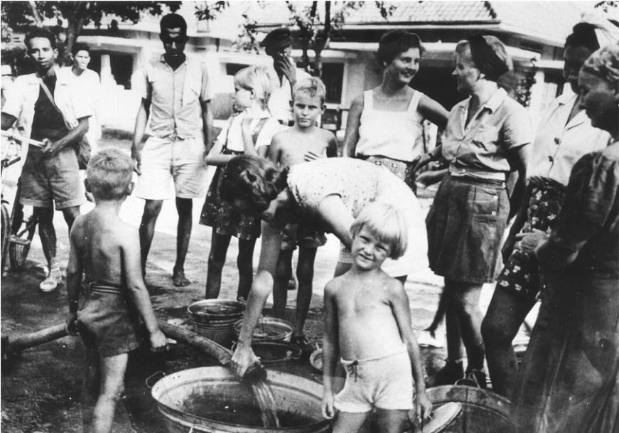
17. Children and adults in a former Japanese prison camp. (RIOD)

The silence or “mildness” Brouwers refers to failed as a strategy of integration because it not only did not help the survivors gain the place they desired in Dutch society, but also prevented them from coming to terms with their past. The “symptoms” of the trauma sustained during the internment and the motifs related to the narrator’s memory of camp life might at first blush seem extreme. They are, however, consistent with the expectations of certain current psychological and therapeutic models. If the symptoms seem extreme, it is interesting to know that this fact need not be interpreted as exaggeration on the part of Brouwers the author. It should rather be noted that the phenomena mentioned fall within the realm considered normal or expected by psychological practitioners who deal with delayed traumatic symptoms, and in particular resemble patterns of behavior of men who were interned in Japanese camps as young boys. Whether this fact means that Brouwers’ characters’ experiences are generally “true” in some sense, or whether one concludes that this demonstrates only