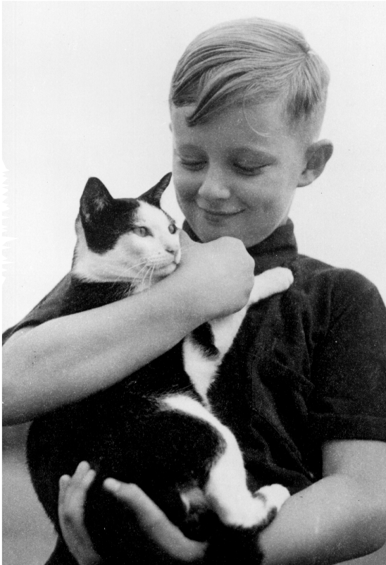
16. Rudy Kousbroek as a young boy, with his cat. (September, 1938)

At this juncture I proceed by pointing to and engaging some of the issues which the combatants raise in the course of their argument. Rudy Kousbroek is one of Brouwers' most persistent critics; in fact the notion of "sibling rivalry" as a set of bitter arguments over a commitment to similar issues closely held seems profoundly relevant to their debates. Kousbroek accuses Brouwers of having assembled Sunken Red as if "uit een Neurembergse bouwdoos" (using a child's building set), and applies his famous coinage, "East Indies Camp Syndrome" ( Oost-Indisch Kamp Syndroom ), to Brouwers' views. The Dutch expression "to pretend to be deaf in the way of the East Indies", ( zich Oost-Indies doof houden ), which dates to colonial times and a lack of