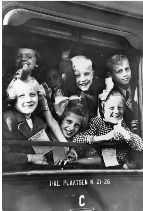
8. Children from Rotterdam traveling to the countryside, where food is more plentiful (1941).

Although For a Lost Soldier is set in the same time period as The Assault and The Glass Bridge and makes use of the common fund of images about the occupation that any Dutch reader would bring to the text, it nonetheless varies considerably from both the Mulisch and Minco stories in that the occupation is not explicitly seen as the moral or historical stage on which the action of the text occurs. The narrative does not detail the deportation of Jews to concentration and extermination camps. It does not refer to the raids in which Dutch citizens were rounded up in order to be deported to Germany as slave labor in the war industry or as hostages. It makes no mention of brave Resistance fighters who put their lives on the line to steal ration cards so that they can feed hidden Jews. This narrative concentrates on a subject too young to be aware of such things. This difference in the child's age introduces an intriguing