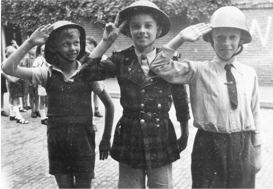
13. Dutch children during the liberation.

Thinking of the possible function of practices of inclusion/exclusion as a component of community-building sheds light on the possible motivations for not only spontaneously persecuting (former) collaborators 28 right after the war (an act which many outsiders can understand if not justify), but also for refusing to recognize their children as innocent and even for continuing this persecution for many decades –