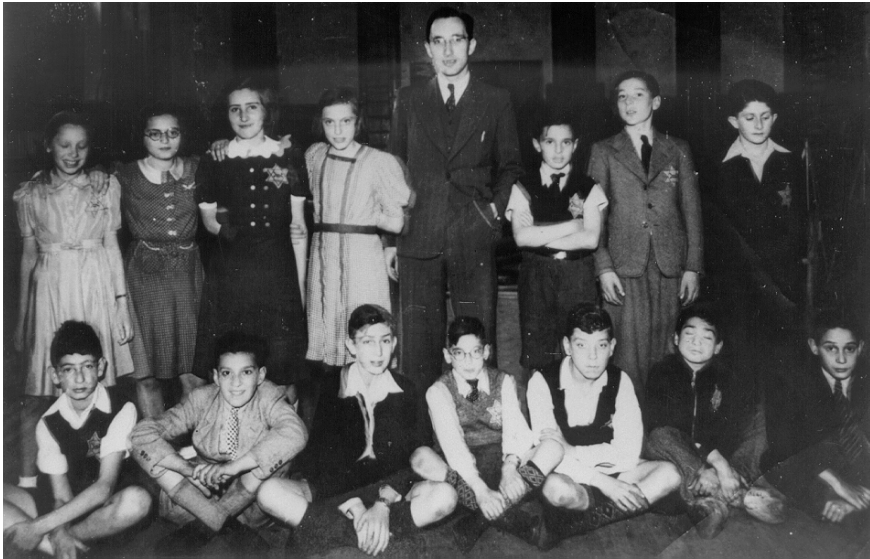
6. Grade six of the Jewish school at Bezemstraat 3 in The Hague.

The element of loss found in these narratives reflects a very real feature of the memory of the occupation for a certain segment of the population of the Netherlands. There are those who claim that the post-war prosperity which the Netherlands enjoys coincides with a loss of social cohesiveness, and lament the loss of solidarity represented by recent developments. References to a culture of solidarity recur again and again in stories people tell of life under the occupation: we had no material goods, but at least we were close to our neighbors, and we shared a common hope for a better future. Thus an oral history of the reconstruction of the country in the immediate postwar era is entitled "How beautiful peace looked while we were still at war." 13 An article about Piet Calis' dissertation, a study of illegal literary journals during the occupation, 14 entitled "We were happy only in the midst of the fire. Writers and journals during a wonderful time behind bars", 15 formulates a sentiment still occasional-