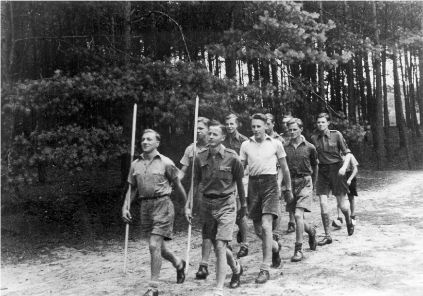
10. Illegal scout troupe in Arnhem.

To a certain extent, the commemorative exercise underscores our distance even as it is used in an attempt to help us remember. It is at once an appeal to common memory and an implicit statement of difference about those who experience the event as