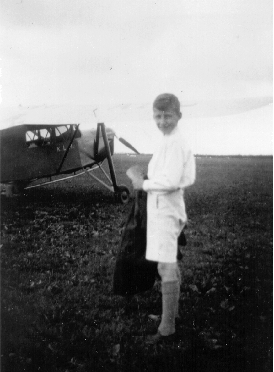
3. Harry Mulisch at Schiphol Airport (ca. 1939).

cidence that later on he will be intrigued by the sextant which he displays in his apartment, and which he explains repeatedly to the young women with whom he half-heartedly and diffidently establishes relationships. The night of the assault ends for Anton with a sign, although he does not consciously interpret it at the time: