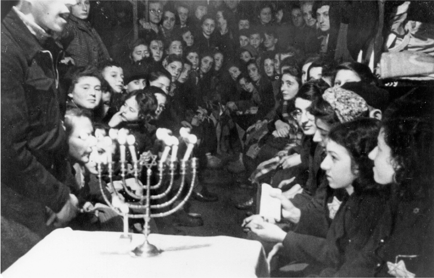
7. Westerbork Transit Camp in the Netherlands.

ly expressed by Dutch citizens who survived the occupation. Fortunately, their bluff has not been called in recent decades.