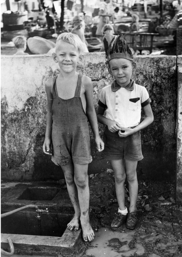
15. Children from Tjideng prison camp, Batavia, Java. Photograph taken after the liberation.

Throughout this text, I have identified a number of works in Dutch literature which show a marked interest in the history and memory of children of the war, and I have discussed a number of fictional and non-fictional texts published in the Netherlands in the 1980s which use the memory of World War II as their thematic material. Evoking the memory of World War II allows the Dutch authors I have considered to take on any of a number of issues; their reasons for doing so range from predominantly formal concerns to the engagement of notions centrally important to the culture. First, the war as a thematic element can provide challenges to the writer's craft by providing a means to inject excitement and upheaval in a (fictional) society which otherwise sees itself as a stable and placid land populated by persons whose everyday lives