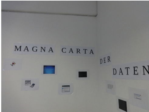
[Fig. 5] Exhibition: Dysfunctional Things. Project: Magna Carta der Datenrechte / Magna Charta of Data Rights (Martina Keup). Photography: Martina Leeker & Laila Walter, Lüneburg 2016.

Data rights have become a very important topic in the world of Owlglass prank in the exhibition, because smart things are technical devices controlled by algorithms collecting and processing data.