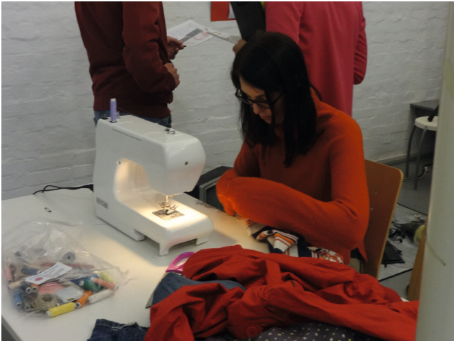
[Fig. 6] Exhibition: Dysfunctional Things. Project: Kleiderflüsternde Nähwerkstatt / Clothes Whispering Sewing Room (Nadine Teichmann). Photography: Martina Leeker & Laila Walter, Lüneburg 2016.

(1) The discourse-on-things and on techno-ecology were taken on seriously and experienced in an exaggerated manner. Non-knowledge and incomprehensibility generated by these discourses, which emerged from the complex agencies and the technological environments, became new possibilities of (non-) knowledge. This knowledge from non-knowledge, and its effects, were clear and concise in the “Kleiderflüsterin” (clothes whisperer). New levels and forms of sensibility were reached by listening to damaged clothes and hearing of their desire for repairs.