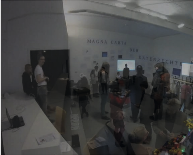
[Fig. 1] Exhibition: Dysfunctional Things. Photography: Martina Leeker & Laila Walter, Lüneburg 2016.

Interfaces, through which human agents gain access to technological environments, are important in digital cultures. Interfaces enable not just control of technological operations; they shape, through their design, the behavior of users. They are therefore a sensitive gateway to the technological worlds and models and regimes of human-machine interaction. The exhibition asks what would happen when, assuming a radical equality of things, interfaces are disrupted and cannot be thrown away? In this context, a workstation was created that had a defective computer mouse, which performed self-willed movements enabling the production of strange drawings.