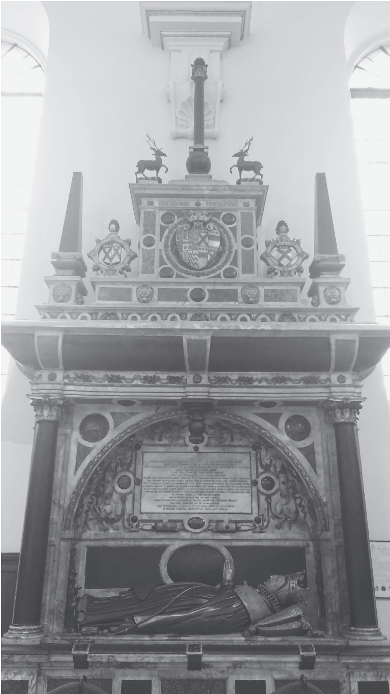
Figure 22.1. Robert Smythson. Tomb of Elizabeth Talbot, Countess of Shrewsbury (Bess of Hardwick). Ca. 1601, alabaster. Church of All Saints (Derby Cathedral), Derby. Eva Lauenstein.