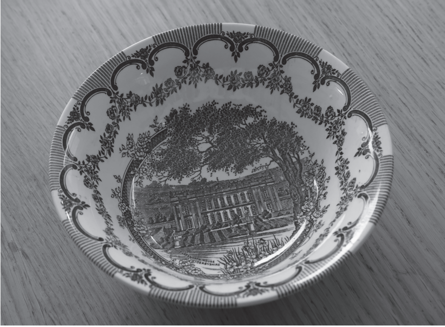
Figure 21.1. Brown and white tableware bowl with view of William Talman's 1687–1688 remodelling of Chatsworth House.