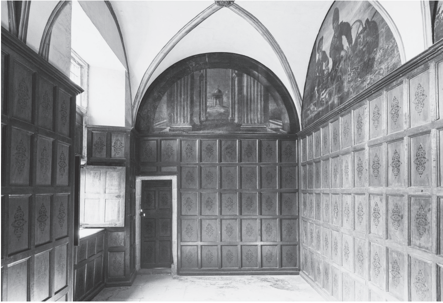
Figure 4.2. A tempietto in the Anteroom of the Little Castle at Bolsover. Oil on plaster. Lunette 157.5 × 305 cm.

friendship with the hosts, and familiarity with the source prints by Martin de Vos. The contrived compositions are cryptic but also flattering, amusing, and multisensory: calculated to engage William's cultivated circle, his "fresh golden guests, guests o' the game" (Jonson, The New Inn , 1.5.2). They have a mildly bawdy tone, which corresponds with the boisterous private show commissioned from Jonson in 1620, around the same time the pictures were commissioned, for a Cavendish christening at Blackfriars. This was evidently considered suitable for Prince Charles and the Earl (later Duke) of Buckingham, who were among the invited company and who are referenced in the text. 62