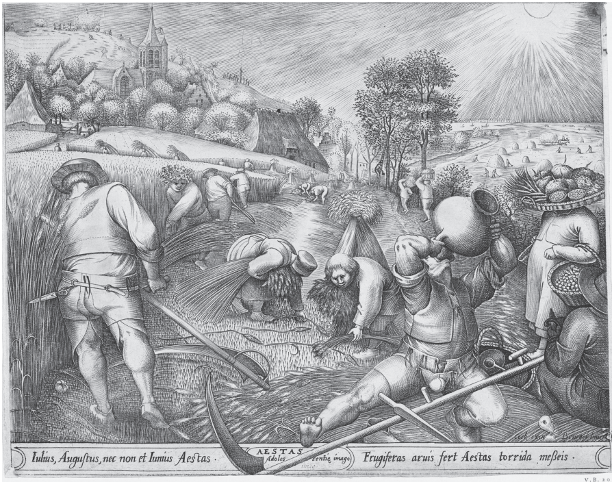
Figure 10.4. Hieronymus Cock, after Pieter Bruegel and by Pieter van der Heyden. The Four Seasons: Summer . 1570. Museum number F,1.24.

The long and glowing evocation of the pleasures of country living, however, is merely a prelude to disillusionment, for eventually the Gentleman realizes that he sorely needs to give some thought to his financial situation: