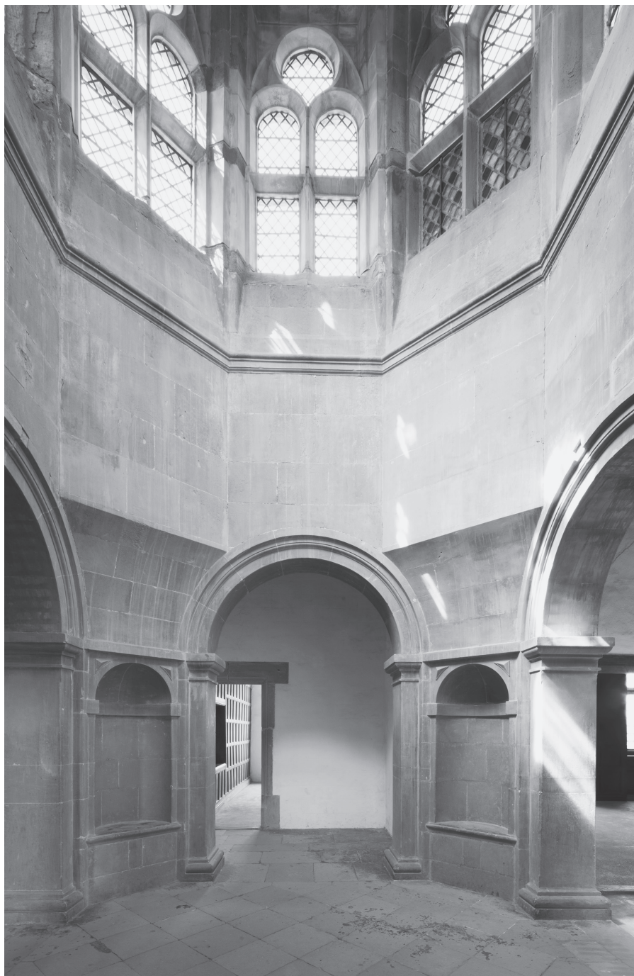
Figure 4.1. The lantern space on the second floor of the Little Castle at Bolsover.