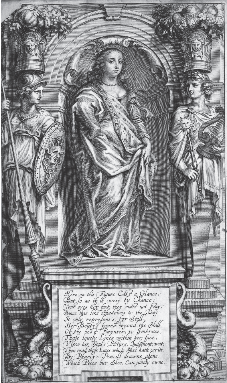
Figure 17.1. Frontispiece of The Worlds Olio (1655). The University of Sheffield Library.