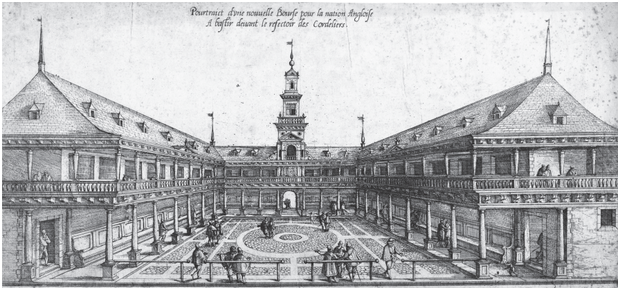
Figure 10.2. The English Bourse, Antwerp, 1670–1700. British Museum number Ee,8.100.

And so up a pair of Stairs into a large Room, where was a Guard of Soldiers with Halberts, which were more for shew than safety; for the Halberts lay by, and great Jacks of Beer and Wine were in their hands. 24