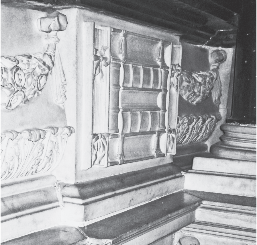
Figure 22.4. Grinling Gibbons. Tomb of William Cavendish, 1st Duke of Newcastle and Margaret Lucas Cavendish, Duchess of Newcastle (detail). Before 1676, marble. Westminster Abbey, London.

female kin. In life, Margaret used text in lieu of the “stately Monument” to support her family’s claims to land, status, and power. In death, funerary architecture works to physically insert her writing into the symbolic heart of social and political power (Figure 22.4).