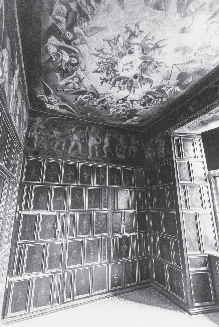
Figure 4.3. Christ with joyful and sorrowing angels in the Heaven Closet of the Little Castle at Bolsover. Oil on plaster. Ceiling 370 × 300 cm.