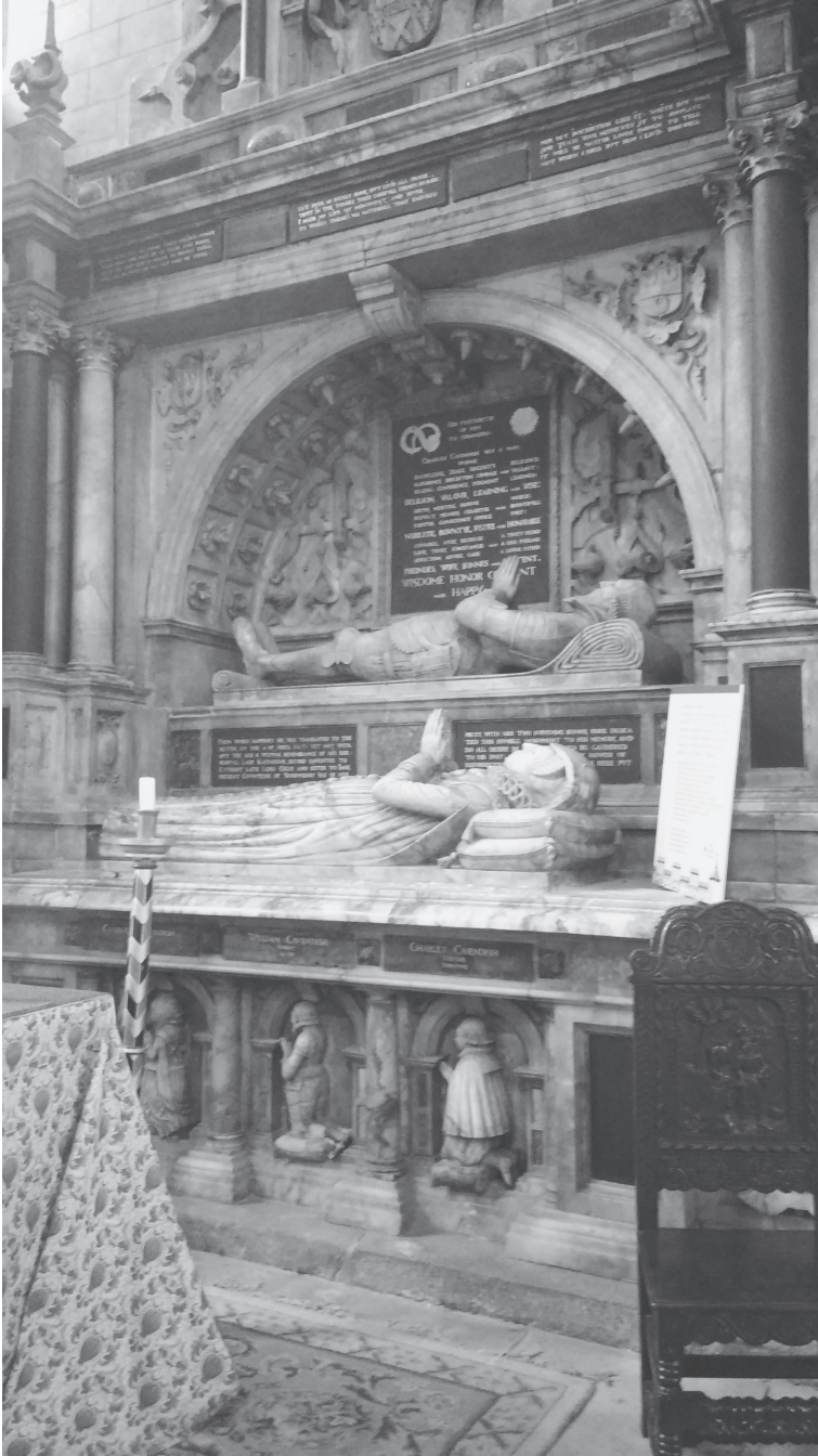
Figure 22.2. John Smythson. Tomb of Sir Charles Cavendish and Katherine, Baroness Ogle. Ca. 1618, alabaster. Church of St. Mary and St. Laurence, Bolsover.