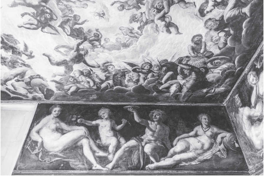
Figure 4.4. The theme of love in the Elysium Closet of the Little Castle at Bolsover. Oil on plaster. Cornice 105 × 370 cm.

irreverent use of stories from Ovid. 65 As in the Heaven Closet, the scheme is flattering, pleasantly shocking, and amusing, and there is a parallel Neoplatonic ascent.