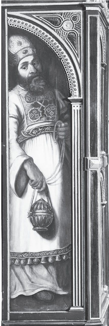
Figure 4.5. Aaron in the Star Chamber of the Little Castle at Bolsover. Oil on panel. 200 × 45.5 cm.