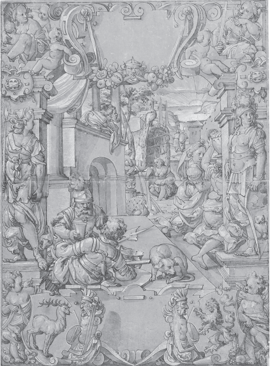
Figure 10.3. Christoph Murer, Two Soldiers Drinking and a Bathing Scene Behind . 1573–1614. British Museum number 1865,0311.166.