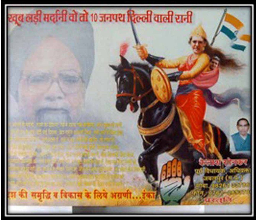
Figure 1.1 Popular Congress Party Election Posters depicting Sonia Gandhi as the Rani of Jhansi.

Hindi novel, Jhansi Ki Rani , the Queen repeatedly states that the nation must have Swarajya (self-rule). Anachronistic, for sure, as the Rani fought for Jhansi and for the larger Maratha conglomerate of which Jhansi was a vassal state, but there is no evidence that she fought for the nation manifested as India. Replicating Varma's nationalism in the new film, the Rani rips through the Union Jack with her sword, crying out Azaadi (freedom). Representing the distance between the concerns and preoccupations of 1946 (Varma's novel) and the language of 2019 ( Manikarnika , the film), the concepts of Swarajya (self-rule) and Azaadi (freedom) dovetail with the historical moments of their audience rather than their story. While self-rule is really not a concern for India in 2019, the liberty, dignity, and freedom of women remain under threat.