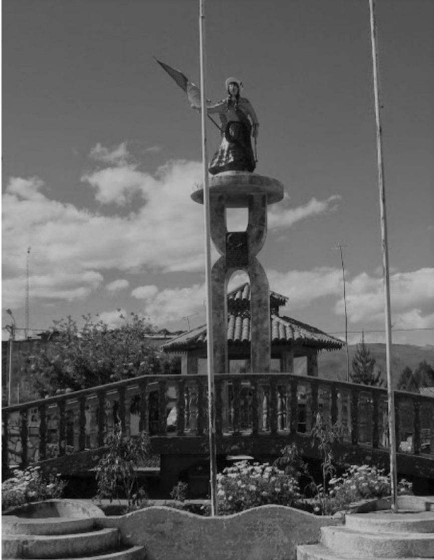
Figure 10.2 Leonor Ordoñez Monument, Huancaní, Perú.

resistance against the occupation in the town of San José de los Molinos, where, crying out “Not one step! Long live Peru!” she died, impaled on the staff of the Peruvian flag. 59