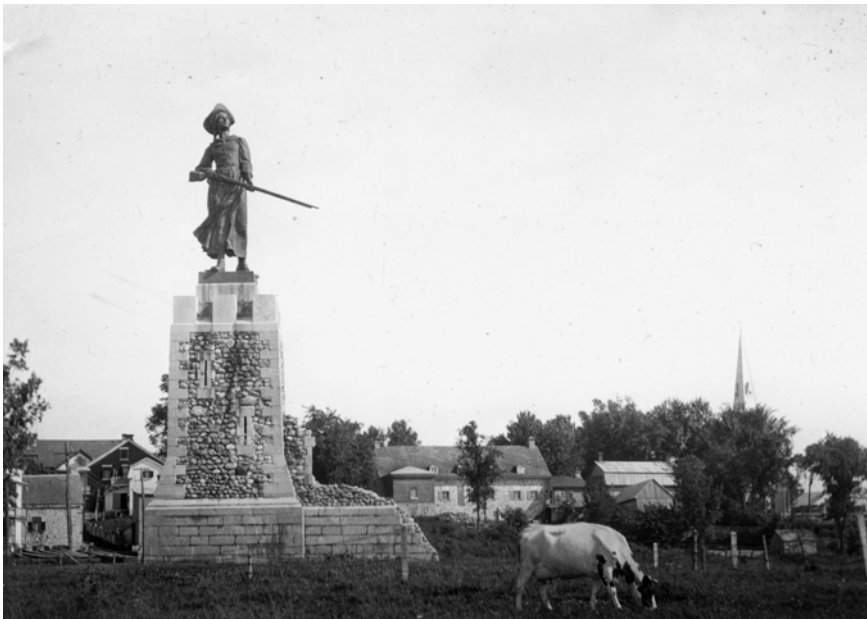
Figure 7.2 Statue of Madeleine de Verchères, Verchères, QC, about 1925.