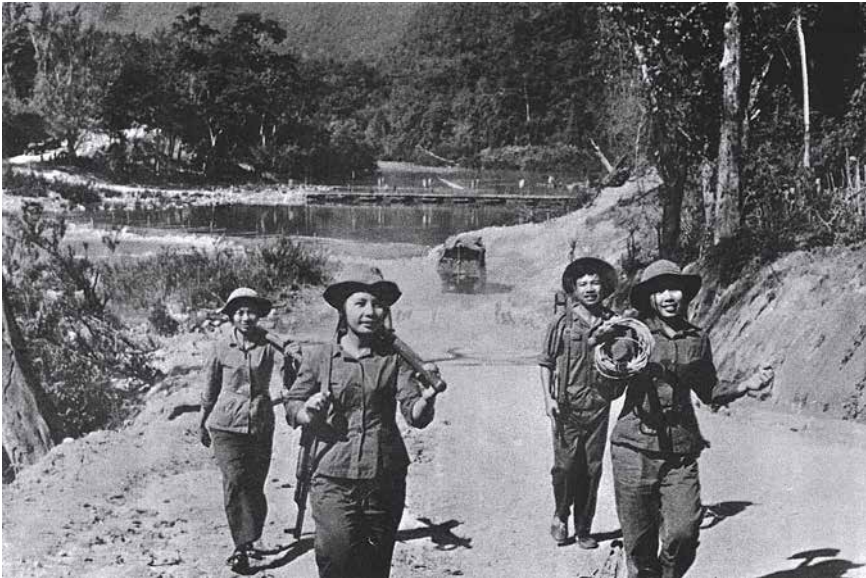
Figure 12.1 Young People on the Trail, date unknown.

These teen-soldiers (sometimes even child-soldiers) armed only with simple pickaxes and shovels and with little intellectual grounding, given their few years of elementary school education, often found themselves propelled into the line of fire. They had no military knowledge and so were trained on-the-job . . . . The shock must have been particularly brutal for girls from urban areas, many of whom only knew how to hold a pen or carry out simple household tasks . . . . Bodies were struck down by fever, hunger and death. The hostile environment was infamous for its rains, mud, poisonous vines and leeches. Daily life was a series of accidents, bombings, and chemical attacks. The most common feelings were pain, fear, and horror. 11