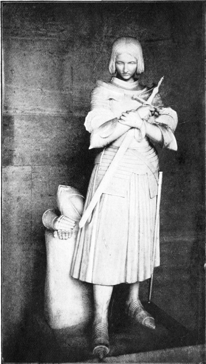
Figure 8.2 Jeanne D'Arc, from the statue by Princess Marie of Orléans in the gallery at Versailles, from Mark Twain, Personal Recollections of Joan of Arc.