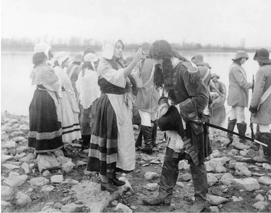
Figure 7.3 Still photograph from scene of motion picture Madeleine de Verchères

she leaves in the hands of the Haudensonee warrior. Like the statue, the tests to her gendered role entail her donning a male hat and engaging in military activity. She never changes her dress for a jerkin. Going further, the script reasserts her gender by inserting a love story into the narrative. The film opens with scenes of domestic happiness, including a game of blind man's bluff. Verchères, her eyes covered, tags the man who would later become her husband, Pierre-Thomas Tareu de La Pérade. When Tareu de la Pérade leaves for Québec along with the other French troops, Madeleine de Verchères hangs a cross around his neck.