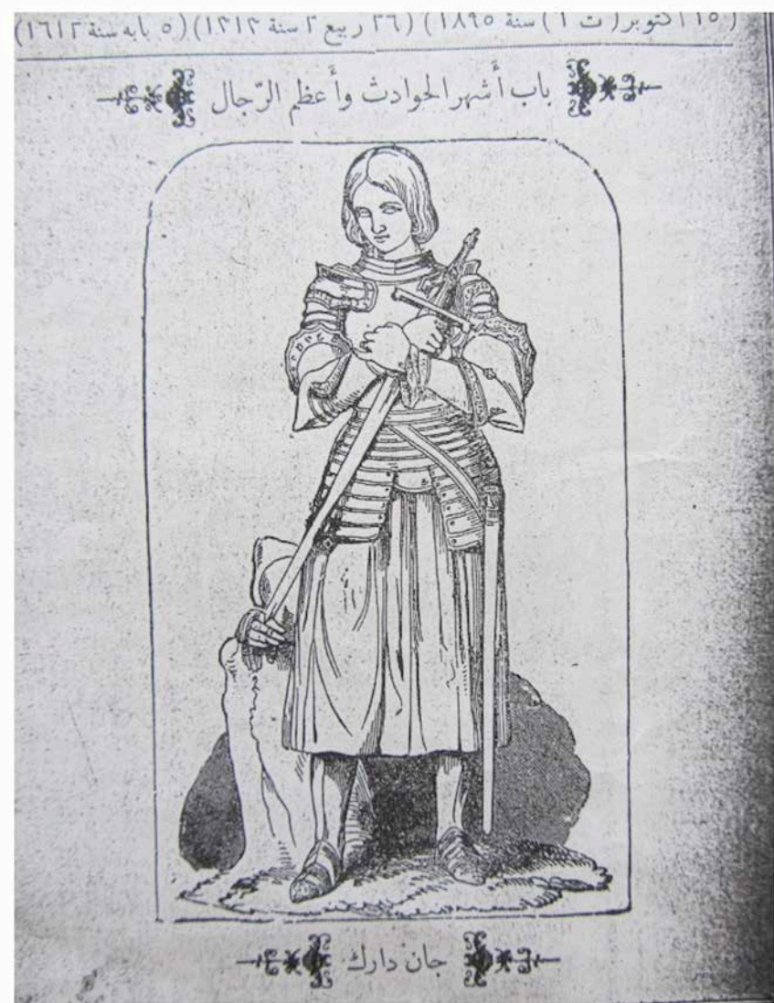
Figure 8.1 Frontispiece to al-Hilal 4: 4 (October 15, 1895). Private collection of M. Booth.

hair; a lowered, averted gaze; short tunic or skirt; and upper body armor. Her crossed arms hugged a sword; another hung at her side. The tip of the sword between her arms fell in front of a second element, a vague shape with hands or gloves distinct. This image must have been derived ultimately from a popular statue by Marie d'Orléans (1813–39) of Jeanne d'Arc at prayer. This work was the model for numerous images of Jeanne across Europe, particularly as it could be “read” in various ways, as Nora Heimann has demonstrated (Figure 8.2). 40 Likely, al-Hilal's image came from a secondary rendering;