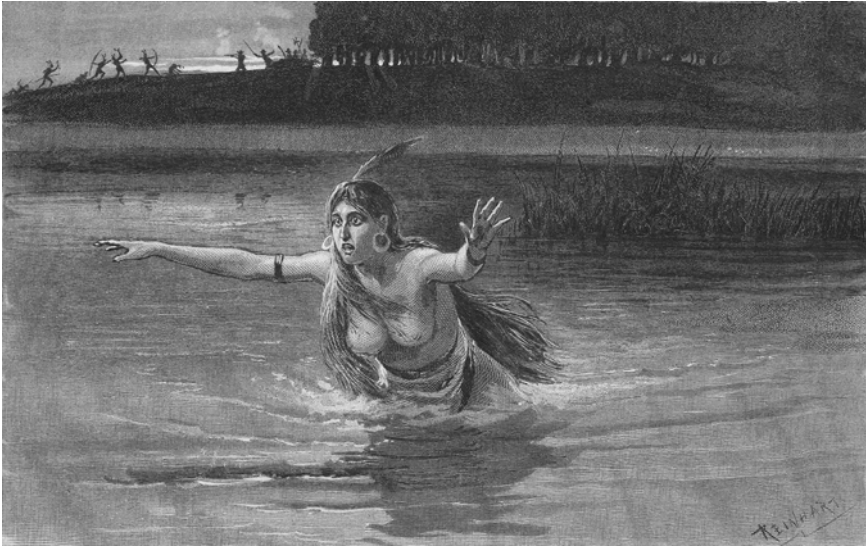
Figure 5.2 “Weetamoo Swimming the Matapoissett” by C.S. Reinhart and S.A. Schoff in William Cullen Bryant and Sydney Howard Gay, A Popular History of the United States , vol. 2 (New York: Charles Scribner’s Sons, 1883), 405.

women. Portrayed as doomed queens, some of whom had failed to maintain “proper” domestic arrangements, female sachems’ relationships to civilization and nature stood in opposition to those of English women. Theirs was a more “primitive” manifestation of womanhood, and it rendered them vulnerable to a wilderness they supposedly embraced. In these colonialist narratives, female sachems would become ghostly figures, separated from the land they ruled and vanishing before the power of the civilizing martial mothers of the United States. 6