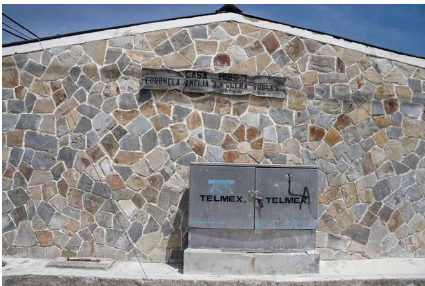
Figure 9.2 Community Museum Coronela Amelia Robles in 2012.

The binary gender of the nationalist celebration of the Mexican revolution that paved the way for the official acceptance of Robles's masculinity would eventually deny his transition and push him back into a female identity.