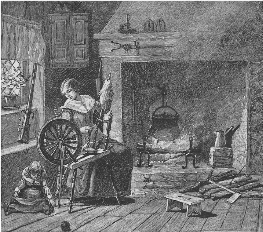
Figure 5.1 “New England Kitchen Scene” in Joel Dorman Steele, A Brief History of the United States (New York: A. S. Barnes & Company, 1885), 94.

The moody atmosphere of “Weetamoo Swimming the Matapoissett” and the sunlit, wholesome kitchen of the colonial mother reflect two distinct nineteenth-century visions of remembered martial womanhood. They also reveal the significant work performed by authors and artists who shaped those memories. Such portrayals served to legitimize the seventeenth-century conquest of New England and encourage the ongoing colonization of the American West in the nineteenth century. In histories, textbooks, poems, plays, sculpture, and images, authors and artists depicted Anglo-American women embracing their role as “pioneer mothers of the republic,” feminine civilizers and fierce maternal protectors who conquered the New England wilderness and Indigenous peoples. 5 Indigenous women—particularly female sachems of the seventeenth century—appeared in these sources as foils for celebrated martial white