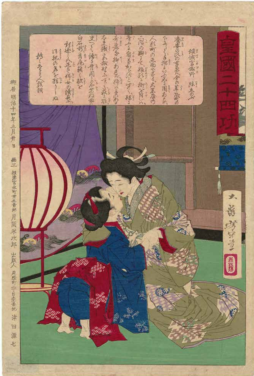
Figure 4.2 Tsukioka Yoshitoshi, “The Courtesan Miyagino and Her Younger Sister Shinobu,” from Kōkoku nijūshikō , 1881.