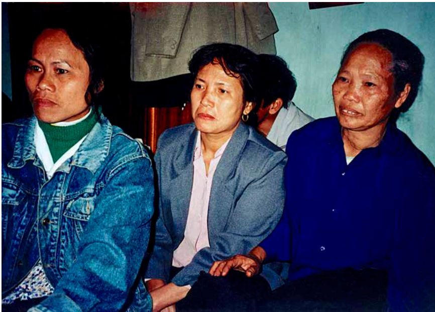
Figure 12.2 Veterans of Company 814, Hanoi, 1996.

Many men who encountered women in unexpected places maintained traditional attitudes. General Phan Trung Tue, commander of Division 559 in charge of the Trail, praised the female volunteers who built a section of the road through particularly rugged terrain. 44 “It was constructed out of nothing but the determination and spirit of the young volunteers with their primitive tools. It was called by different names: ‘Determined to Win,’ and ‘Road 20’ to mark the average age of the volunteers.” 45 It was not only women’s hard work that intrigued him. When encountering their colorful underwear drying on trees, he likened them to “blossoms of flowers on the mountain slopes.” At one point, before an expected attack, he recalled in his memoir: “I decided to keep only the fittest and transfer the girls back to the second line. Girls could be good