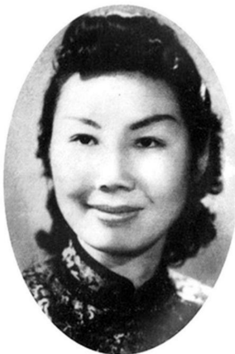
Figure 11.1 A glamorous Guan Lu as a celebrity author.

autobiography, Xin jiu shidai (The era of old and new), appeared through 1938 in the journal Shanghai funü (Shanghai women) and narrates the trials and tribulations of a woman of her time.