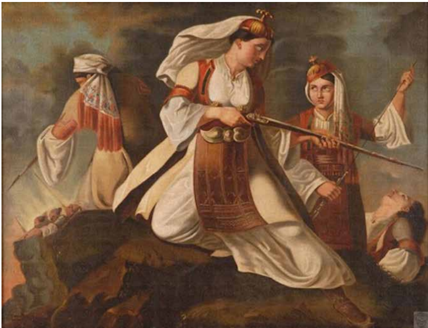
Figure 6.1 Georgios Miniatis. Souliotisses . Second half of the nineteenth century, Public Gallery, Corfu.

In the decades following independence, the Greek state education system praised the two women warriors of the revolution and commemorated the women of Souli for their sacrifice. Sotiria Aliberti's The Heroines of the Greek Revolution , the first Greek book that explicitly wrote about heroines and women warriors, was written in the 1890s but not published until 1933. Aliberti was one of the first Greek female