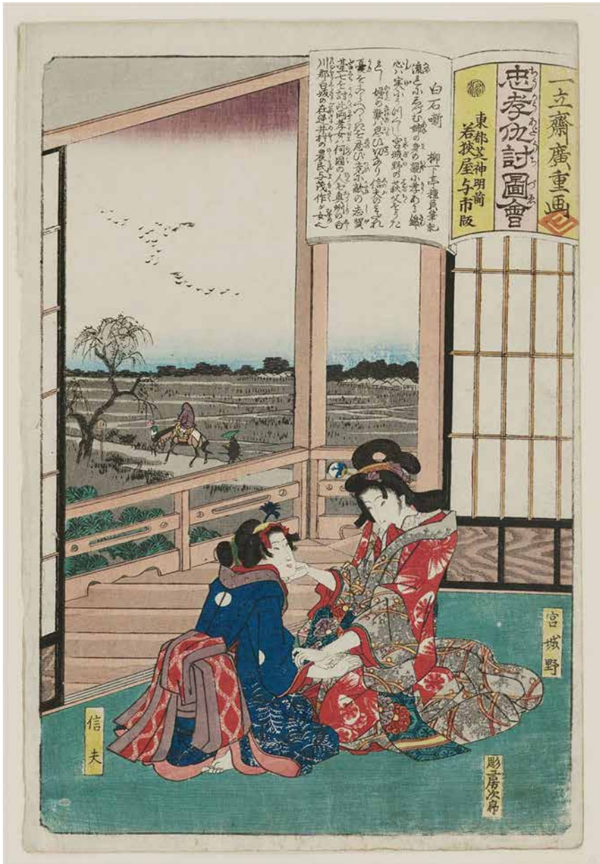
Figure 4.1 Utagawa Hiroshige, “Shiroishi banashi (The Tale of Shiroishi),” from Chūko adauchi zue (Illustrations of Loyalty and Vengeance), 1844–45.