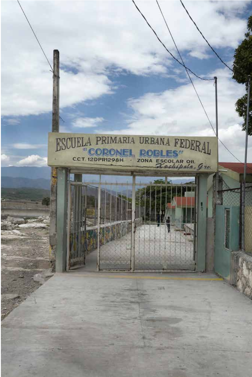
Figure 9.1 Colonel Robles School, Xochipala, Guerrero in 2012.