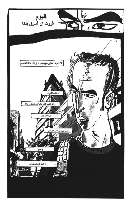
Figure 1 (al-Shāfi'ī 7)

at a Kefaya demonstration or by falling in love with Dina. The final sequence, when Shehab intends to symbolically leave the metro station called Mubarak, might be interpreted as the juncture where Shehab makes his dissent known: He leaves the subway, symbol of his underground activities and at the same time the political state under Mubarak. Like the other ki-fāya narratives, Metro exposes moments and feelings of kifāya , but it differs from them in its less generalizing representation of corruption, the optimistic vision of a vivid non-violent democratic opposition, and the subtle critique of resistance by all means possible. With respect to this critique I would like to analyze the predicament of violence and affects inherent to kifāya literature.