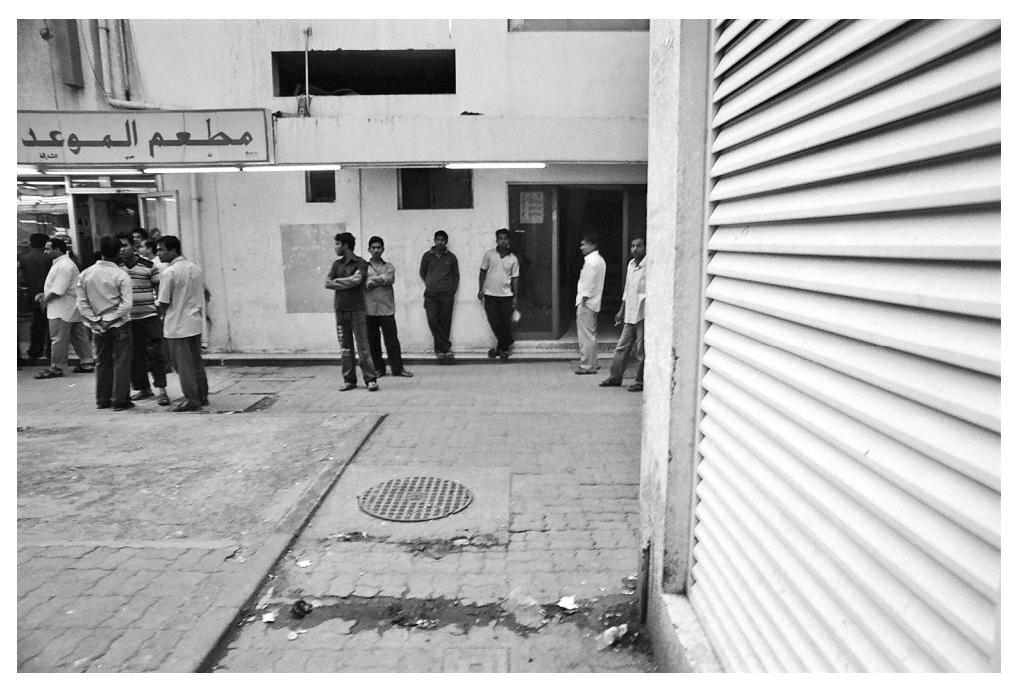
Figure 2. (Courtesy of the artist)