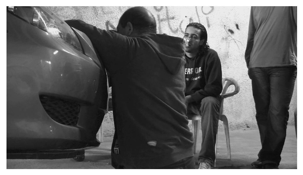
Figure 4. (Courtesy of the artist)