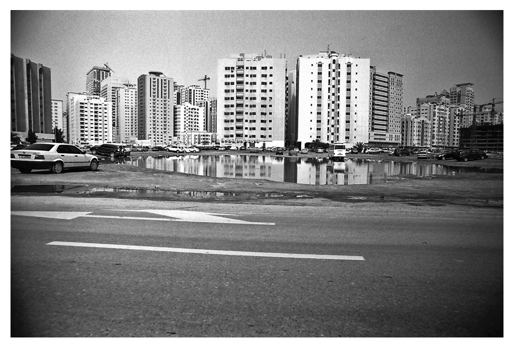
Figure 1. (Courtesy of the artist)