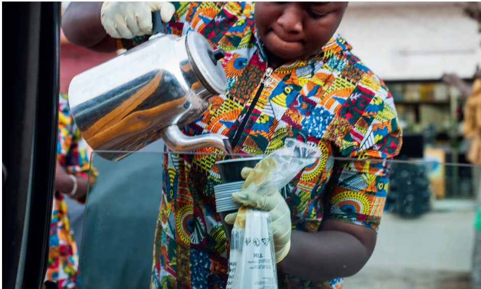
In a car