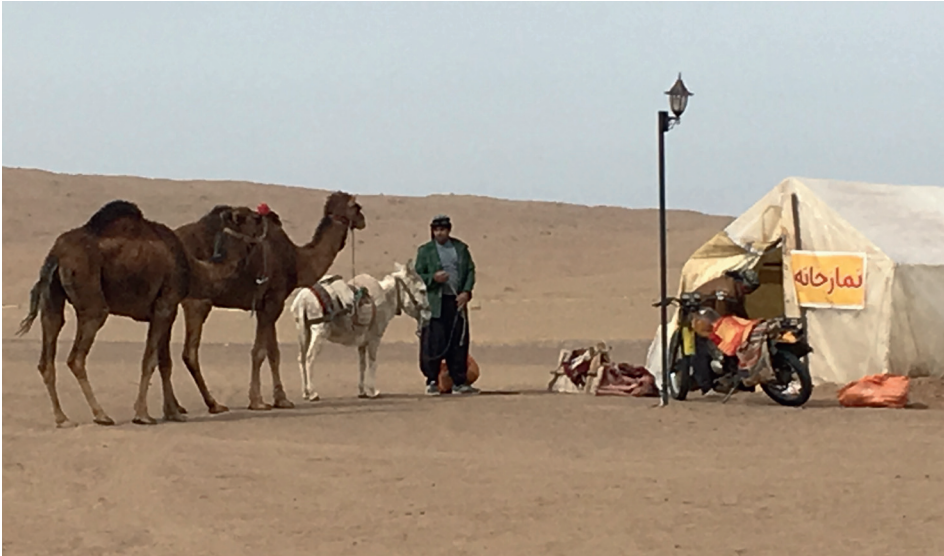
“House of Prayer”.

wisdom to disentangle the authoritarianism of the state from Islam or the clergy. Since anthropological studies on state-society relations in Iran are rare, Iranian civil society often serves instead as a surface upon which images of rebellion against the state and their corollary – longing for the West – are projected. 35 These perceived dichotomies between state and civil society, religion and politics, the religious and the secular are major obstacles in understanding the role of religion in Iran. Indeed, this chapter will not contribute to any categorization, but rather focus on the fluidity between categories and the problems that arise in defining them.