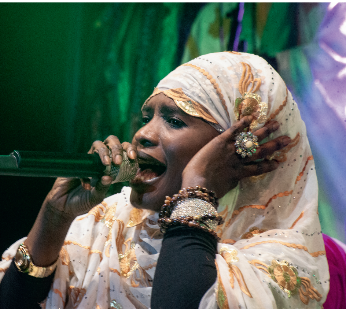
Religious singer Saida Binta Thiam