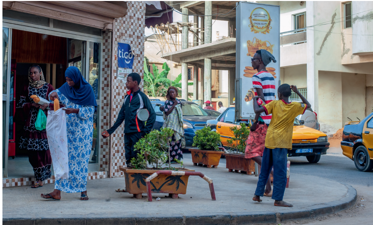
At the bakery