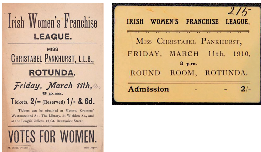
Figure 1. Poster and admission ticket for Christabel Pankhurst's lecture at the Rotunda, Dublin, 11 March 1910 © National Library of Ireland.

in both Irish and more broadly liberal British terms.