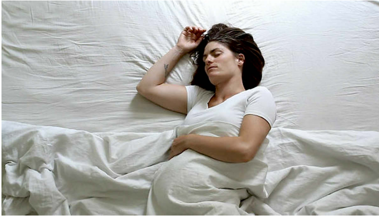
Still from Week 23 (2016) שבוע 23.

of allowing the child to be born is too high. This places the couple in a critical dilemma. Rahel resists the physician's recommendation; her feelings are very clear. The journey that started with such hope turns into an emotional roller-coaster with no rescue in sight.