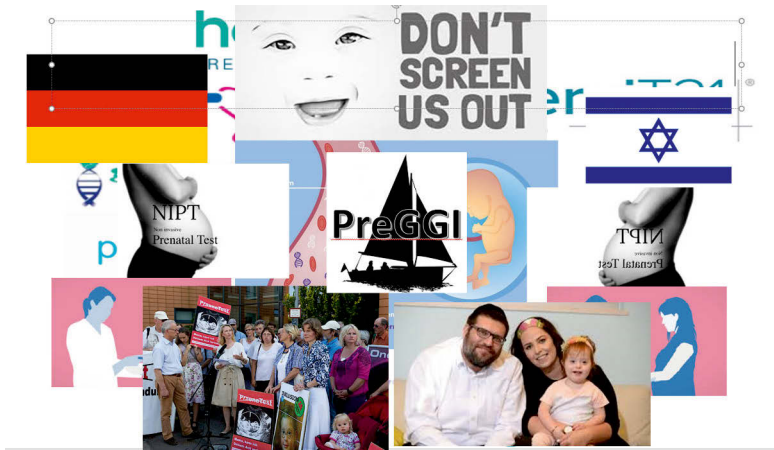
Figure 1 PowerPoint slide showing the layers of the PreGGI project with the sailing boat logo, 5 March 2018, project workshop in Tel Aviv with invited experts.

NIPT. There is the famous “Don’t Screen Us Out” poster from the UK disability advocacy campaign against NIPT, a picture from a demonstration in Germany against PraenaTest, and a picture of a modern Orthodox Jewish-Israeli couple holding a baby with Down syndrome. Each one of these pictures tells a story that is of course only part of a much larger cultural and philosophical puzzle. They all have various political undertones, which could be potentially spelled out or remain hidden. At the very outset of the project, we thus confronted the urgent need to be conversant in various fields, each with its own terminologies and expertise. This is evidently a well-known challenge in any interdisciplinary collaboration. The last part of the collage in the slide was the sailing boat, a centrepiece that is supposed to hold together all the other pieces and layers of the puzzle. The boat carries the acronym of the project, PreGGI, standing for “Practices of Prenatal Genetics in Germany and Israel”.