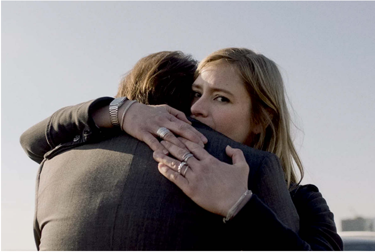
Still from 24 Wochen.