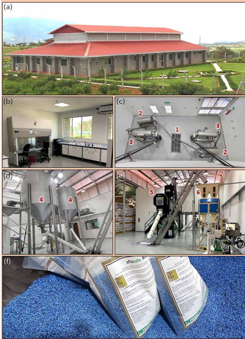
Figure 2 The KALRO/IITA Aflasafe Modular Manufacturing Plant at Kenya Agricultural and Livestock Research Organization (KALRO) Katumani Research Station in Kenya. (a) A side view of the manufacturing plant. (b) The plant consists of a laboratory where the inocula of the active ingredients are produced and combined with a blue dye and polymer sticker. (c) Carrier (sorghum) pit (1) from where sorghum is moved into a grain cleaner (2) with an auger, then transported to a roaster (3) and finally to a cooling silo for cooling and storing the roasted carrier grains. (d) From cooling silo (4), the carrier is transported via a pneumatic line into a seed treater (5) where the master solution (inoculum, dye and polymer) is coated onto the sorghum grain. (e) The formulated