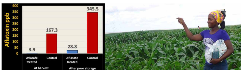
Figure 1 Aflatoxin concentration in parts per billion (ppb) in grains at harvest and after poor storage in biocontrol-treated and untreated (control) fields (left). The effectiveness data are means of over 1500 maize and groundnut fields of farmers who either treated or did not treat their crops with biocontrol products in multiple countries. A farmer broadcasting a biocontrol product in a maize field @ 10 kg/ha 2-3 weeks before flowering (right).

The validity period of registration of aflatoxin biocontrol product is variable. Registrations have been granted for 3 years in CILSS countries and 5 years in others. Two products developed for Ghana were initially granted an Experimental