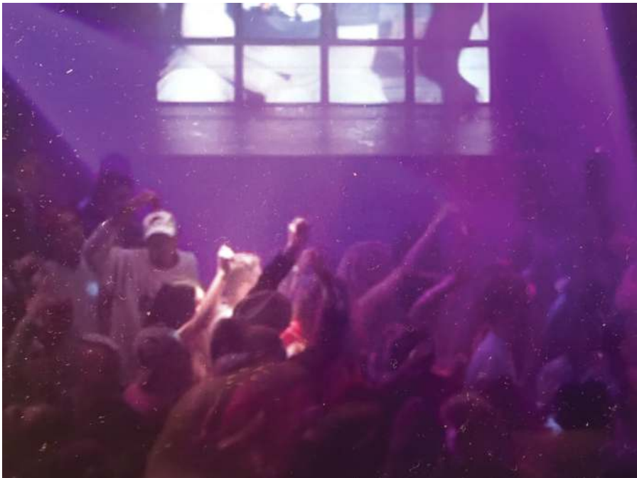
Figure 5.2 A typical Paris rave party, Eden

US. As the group of friends (minus Cyril) settles into the accommodation found for them on their New York visit, Daft Punk's 'One More Time' strikes up and is played in its entirety as we see an accelerated compilation of shots of gigs in Chicago and other cities that form part of the tour. Another entire song interpolated in this section of the film is Terry Hunter's 'Time and Time Again', a perfect example of the blissful communion fans find at the rave, whose final words are 'And now I know paradise'. Stars of the house and garage music scene who appear in the film are Arnold Jarvis, Terry Hunter (who plays Paul his new song 'Your Love' when Paul visits him in New York) and Crystal Waters, who sings 'Gypsy Woman' live when she comes to Paris: love, time and music itself are recurrent themes of the euphoric, reality-oblivious songs in which dancers and DJs alike lose themselves, with the regularity of the club night scenes in the film working on the viewer in the same way that the music draws its proponents in and will not let them go (Figure 5.2). The melancholy that accompanies the euphoria of this music is inseparable from rhythm – not only of