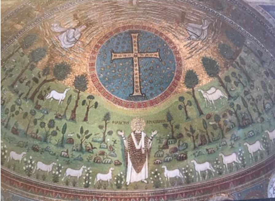
Figure 4.1 Basilica of Sant'Apollinare in Classe, Ravenna, Father of My Children

than the ethical dimension of the tendency towards religiosity identified in Chapter 3, this chapter will develop the account of Hansen-Løve's world-view begun in Chapters 1 to 3, analysing how her visual style combines the bodily and the spiritual in a manner reminiscent of both Christian theology and phenomenological philosophy. I shall begin with a discussion of Hansen-Løve's representations of children, physical passion and pastoral beauty, before moving on to the film philosophies of Rohmer and Bresson and their influence upon Hansen-Løve's image-making (Figure 4.1).