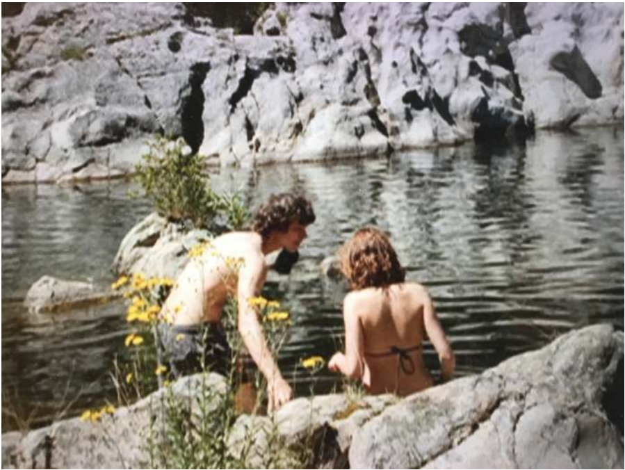
Figure 4.2 Sullivan and Camille swim in the Loire, Goodbye First Love

In the traditional literary sense, pastoral is a genre found from the classical to the Romantic eras, depicting a bucolic society far