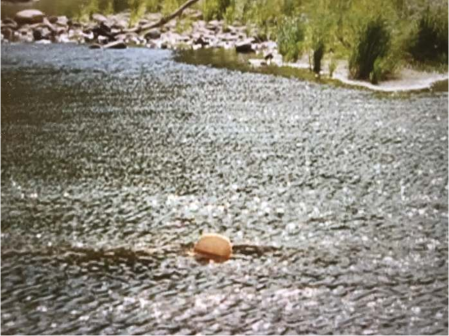
Figure 6.1 Camille's hat floats away downstream at the end of Goodbye First Love

song 'The Water' that dominates thematically (Figure 6.1). Flow as a form of movement is echoed by the more fleeting appearance of rivers in other films, such as the Danube in All Is Forgiven and the Loire again (much farther along its course through France) in Father of My Children .