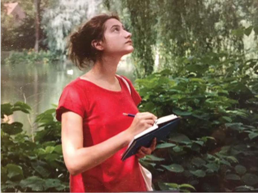
Figure 3.1 Camille drawing, Goodbye First Love

at this, obviously thinking of the solitariness of her life over the four years since the departure of Sullivan (Figure 3.1).