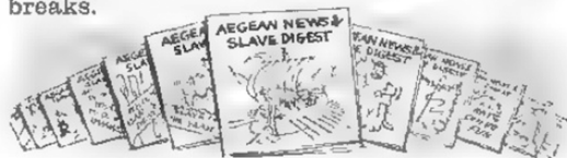
Fig. 1: "If Junkmail had Always Existed," MAD Magazine 232, July 1982.