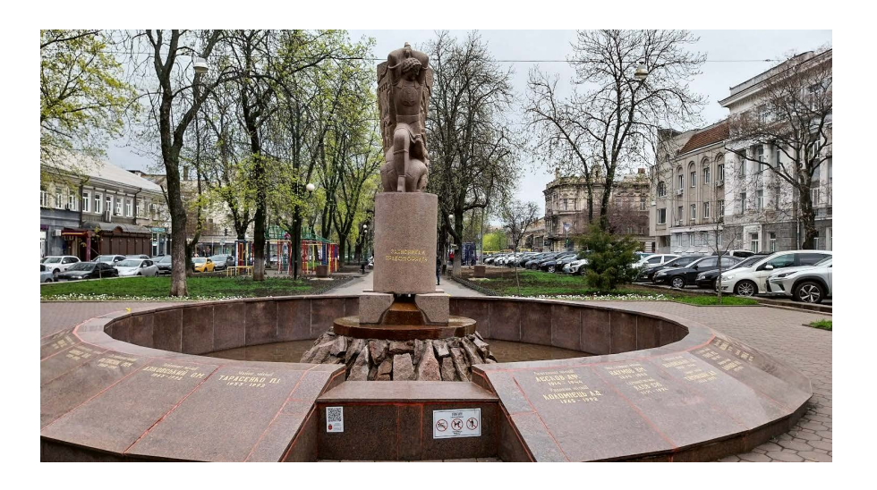
Figure 2.7. Monument to Members of Law Enforcement, Odesa, from 1997. Photo: Mischa Gabowitsch, April 2023.

Figure 2.8. Monument to female fighter pilots killed defending Kyiv from the German forces in 1941, funded by a company called Figaro Catering. Holosiivs'kyi National Natural Park on the outskirts of Kyiv. Photo: Mykola Homanyuk, April 2023.