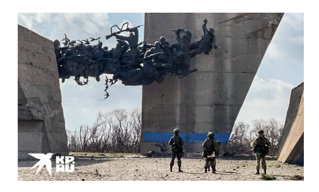
Figure 5.7. A wide-angle shot of armed soldiers gazing up at the Attack monument of 1985 atop Kremenets' Hill in Izium, Kharkiv region.

Russia occupied in 2014. Thus, a May 2022 special edition of the Russian newspaper Komsomol'skaia Pravda for the "liberated territories" showed a soldier-and-sailor statue in Sevastopol', Crimea, in the background of a photo showing the ruins of an unfinished building. The "after" photo simply showed the same monument from a different angle, providing no evidence that it had been in need of, or undergone, renovation, and omitting to mention that construction of the monument, initiated in 1982, had been completed in 2007 in independent Ukraine.<sup>39</sup> Wide shots of supposedly untended war memorials were also shown— pars pro toto —to illustrate general narratives about Ukrainian decline. Thus, one feature from the TV channel Zvezda showed a Great Patriotic War memorial on the territory of the long-abandoned Kherson Machine Building Plant, surrounded by uncut grass and debris, to exemplify the supposed decline of industry in the region under Ukrainian rule.<sup>40</sup>