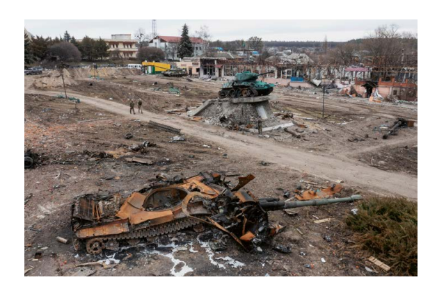
Figure 5.10. High-angle shot to survey scenery of destruction and to juxtapose a Soviet-era tank monument with an ineffective present-day Russian vehicle. Trostianets', Sumy region. Photo: Efrem Lukatsky / AP / picturedesk.com, March 26, 2022. Reprinted with permission.

in the background, Kherson's main memorial to the Heavenly Hundred and the ATO is blurred and cut off. ^{66}\,