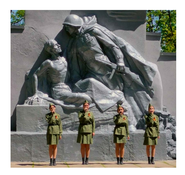
Figure 4.4. Victory Day concert at the memorial to Victims of Fascism in Volnovakha, Donets'k region. The monument has been turned monochrome again (compare figure 2.9).

monument, including its concrete base and back wall, painted a monotonous gray to serve as backdrop for a concert by four girls in Red Armystyle sidecaps and skirts (figure 4.4).<sup>89</sup>