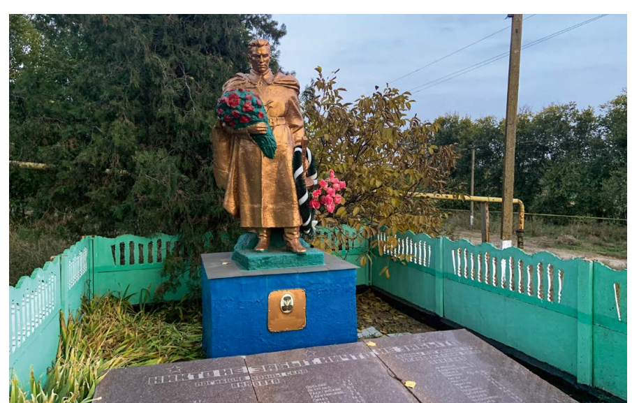
Figure 2.25 (top left). Wreaths and a bottle of piña colada at a memorial to prisoners of war killed by the Nazis in 1943 on the railway section Kharkiv-Pokotylivka near the village of Pylypivka, Kharkiv region. Photo: Mykola Homanyuk, June 2020.

Figure 2.26 (top right). Memorial to the 193rd and 195th Rifle Divisions and the 9th, 19th, and 22nd Motor Corps. Route E-40 near the village of Andriïvka, Zhytomyr region. Photo: Mykola Homanyuk, June 2023.