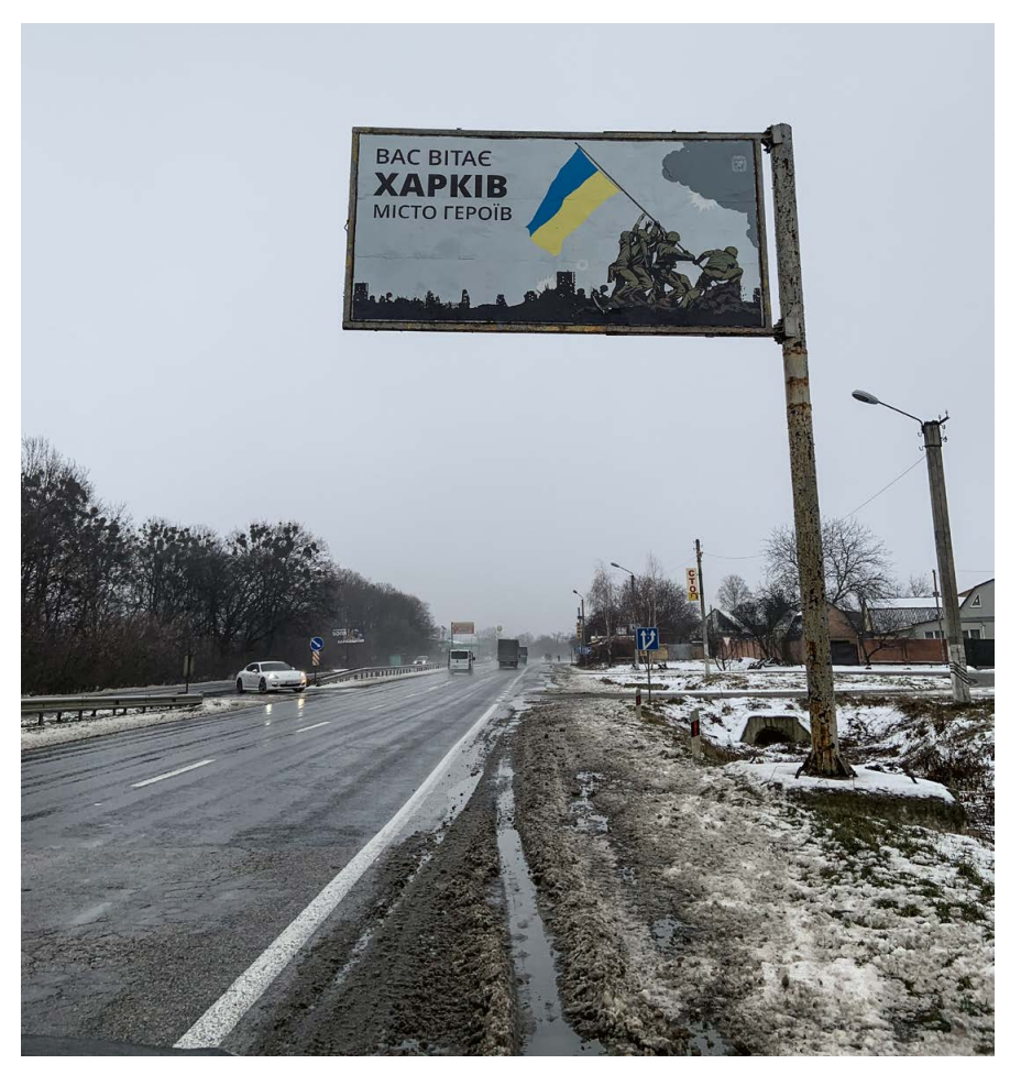
Figure 5.12. "Welcome to Kharkiv, city of heroes," route E105. Photo: Mykola Homanyuk, December 2022.

the equestrian statue of Bohdan Khmel'nyts'kyi in Kyiv from 1888 stands for the defense of Kyiv or Ukrainian revenge. ^{87}