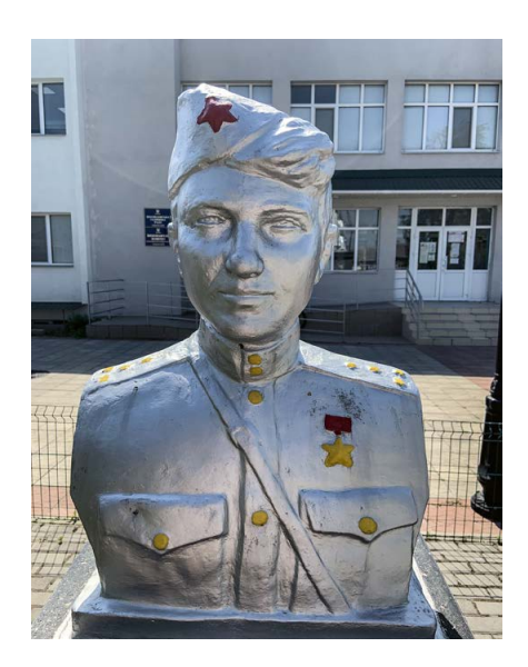
Figure 2.15 (bottom). Great Patriotic War memorial in the village of Topol's'ke, Kharkiv region.