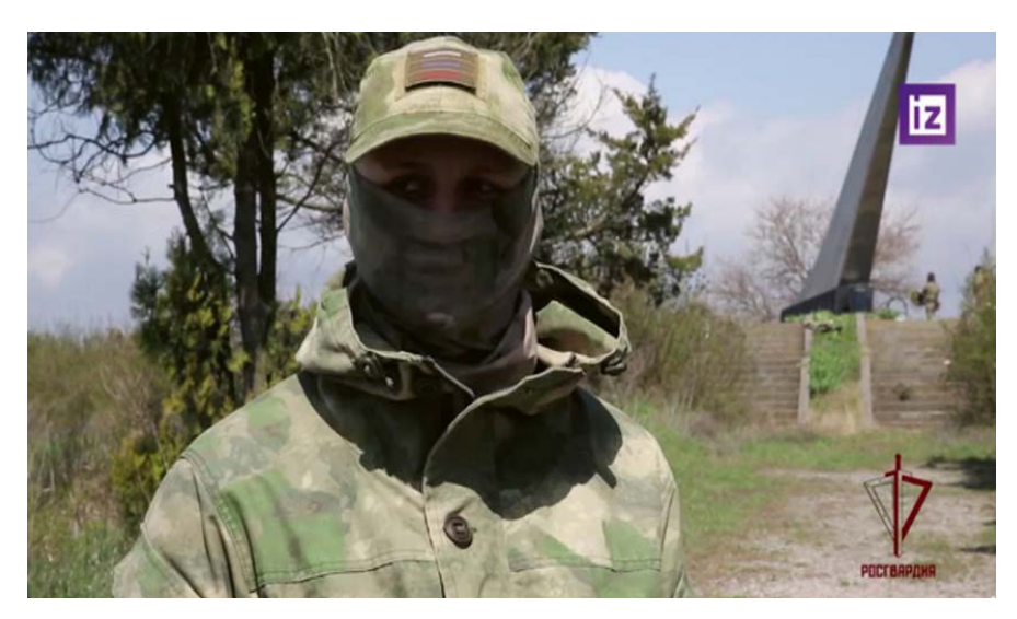
Figure 5.1. Interview with an anonymous "soldier of the Russian National Guard" during maintenance work at the Memorial Sign to the Skadovs'k Airborne Formation at the entrance to Skadovs'k (a KS-1 cruise missile mounted on a pedestal). Interviews with masked soldiers against the background of a monument were frequently broadcast from the occupied parts of Ukraine. Screenshot from a video posted to the Telegram channel REN-TV, April 27, 2022, t.me/rentv_news/45362.

gesting a parallel to victory in World War II after the initial Soviet retreat. Other messages from the same day sugarcoating the Russian retreat also used war memorials as backgrounds. Prior to the retreat, the use of monuments, and especially Second World War memorials, had spiked in September 2022, during the runup to the sham referendums on the occupied territories joining Russia. Sal'do continued to use war memorials as locations for many of his videos after his flight from Kherson; thus, on Victory Day 2023, he recorded a Ukrainian-language message calling upon Ukrainian soldiers to lay down their arms, while standing below a famous Civil War monument located on a mound in Kakhovka, Kherson