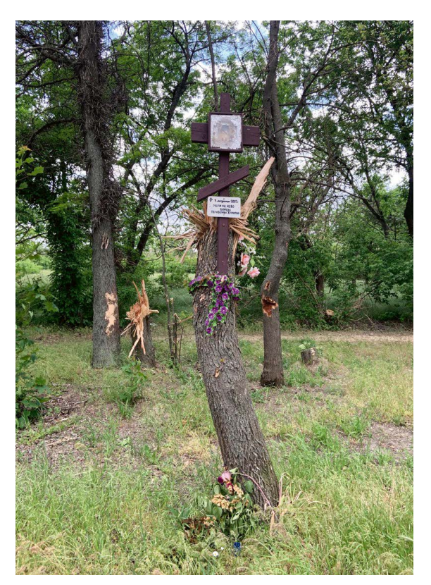
Figure 6.6. Memorial to fallen members of the Territorial Defense with the inscription "This memorial sign marks the site where fighters of the 124th Brigade of the Territorial Defense of Ukraine's Armed Forces fell while defending Kherson from the Russian invaders in February-March 2022. From fellow members of the 124th Brigade and the Themis volunteer unit." Lilac Grove, Kherson.