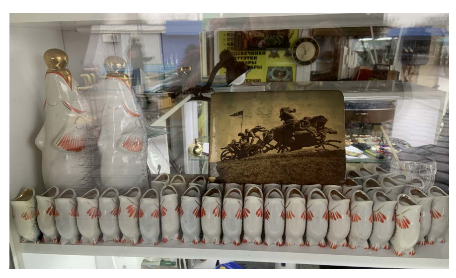
Figure 2.3. A Civil War memorial known as The Legendary Machine-Gun Cart ( Lehendarna Tachanka ) was installed in Kakhovka, Kherson region, in 1967 to mark the 50th anniversary of the October Revolution. In the Soviet period the memorial was a fixture of regional souvenirs such as figurines, desk awards, medallions, and pins. The photo was taken in an antique shop in Heniches'k, Kherson region. Photo: Mykola Homanyuk, November 2019.

in the Donets'k region, a famous example of cubo-futurism in Ukrainian Soviet art—they retain a local significance at best (see figure 2.1). Most of the Civil War monuments that did gain greater prominence were built in the 1960s and 70s, buoyed by the cult of the Great Patriotic War of 1941–45 (see figures 2.2 and 2.3).