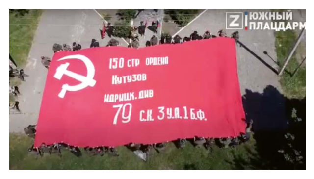
Figure 5.8. "Cossacks from Melitopol' and Enerhodar," Zaporizhzhia region, unfurling a 200-meter Victory Banner near the Memorial to Local Warriors in the Great Patriotic War in the village of Rozivka, Zaporizhzhia region, during a ceremony for the 799th anniversary of the "tragic battle of the Kalka River." The inscription on the Victory Banner contains several mistakes. Screenshot from a video posted to the Telegram channel luzhnyi platsdarm , May 25, 2022.

Cart (Tachanka) in Kakhovka, Kherson region, and the Memorial of Glory for the Great Patriotic War on Kremenets' hill in Izium, Kharkiv region. However, due to their semi-rural positions, these memorials are known for their silhouettes rather than their location. In 2021, a photo of Kakhovka's Tachanka monument was erroneously used on a banner in the Russian city of Rostov-on-Don to symbolize love of the city, instead of Rostov's own similarly named but stylistically different Tachanka monument.<sup>59</sup>