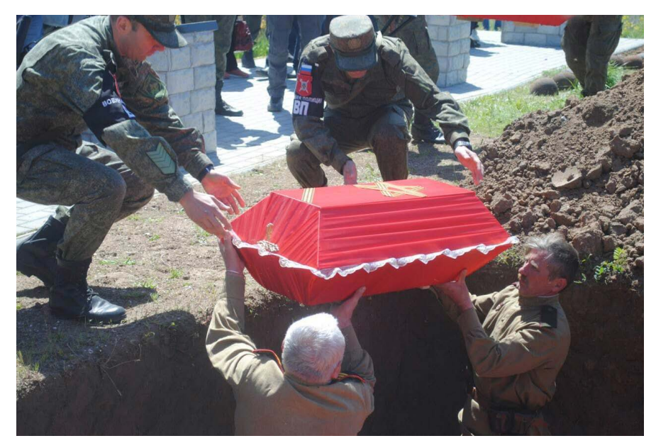
Figure 4.1. Reburying the remains of soldiers who died during the Second World War, Memorial of Glory in the village of Mordvynivka, Zaporizhzhia region. The ritual involved an honor guard by the Russian military police with a Soviet flag, a priest asperging the coffins with holy water, a gunfire salute, reenactors, and people standing inside the grave lowering the coffins. A similar ritual took place in the Luhans'k region.

mentioned reburial ceremony in Mordvynivka, Zaporizhzhia region, involved child-size coffins adorned with pentagrams made of St. George's Ribbons (see figure 4.1). ^{53}