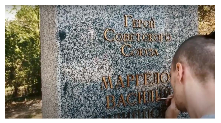
Figure 4.5. Painting letters on the pedestal of a monument to General Marhelov in Kherson. In the occupied territories, gold paint was widely used to paint both metal and engraved letters on the bases of monuments. Non-painted letters were demonstrated as evidence that monuments in independent Ukraine were not taken care of.

ration was provided by a number of Russian political organizations, even though Russians had earlier been scandalized by such practices when they encountered them, for example, in occupied Crimea. 92