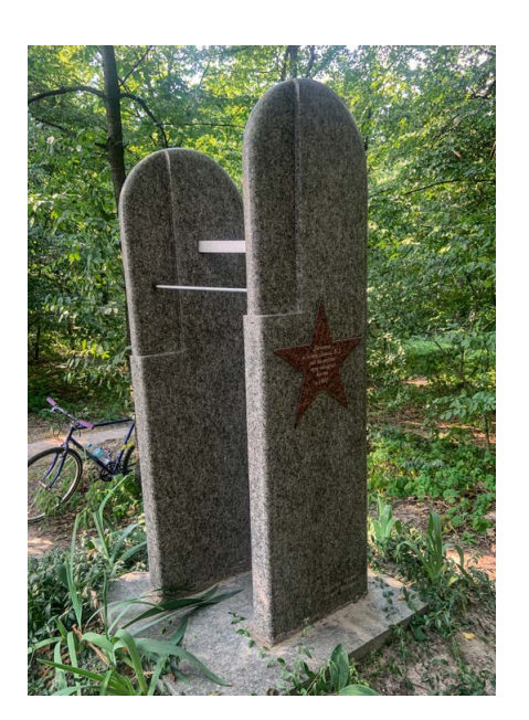
Figure 2.8. Monument to female fighter pilots killed defending Kyiv from the German forces in 1941, funded by a company called Figaro Catering. Holosiivs'kyi National Natural Park on the outskirts of Kyiv. April 2023.

and often lethal battle against organized crime, they likewise reference policemen (though few if any women) from both the Soviet and post-Soviet periods (see figure 2.7).