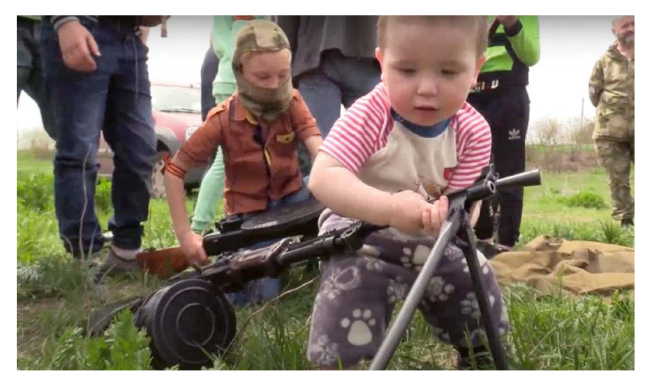
Figure 7.3. Field trip for children from Enerhodar, Zaporizhzhia region, and their parents to the village of Velyka Bilozerka. The trip included a visit to a memorial on a common grave, a meeting with volunteer searchers, an introduction to firearms, and lunch. Screenshot from a video posted to the Telegram channel luzhnyi platsdarm on May 4, 2022, https://t.me/yug_plazdarm/6665.

Ukraine<sup>35</sup> but has become especially common in Russia in recent years (see chapter 5 for examples).