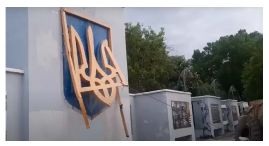
Figure 3.5. An armored vehicle removing the Ukrainian coat of arms from a memorial to the Heroes of Independent Ukraine in Kherson.

turing territory and then tended to garrison in the larger cities, the main branches engaged in policing occupied areas, including smaller towns and villages, were the National Guard ( Rosgvardiia ) and military police. They were also the main Russian groups interacting with monuments.