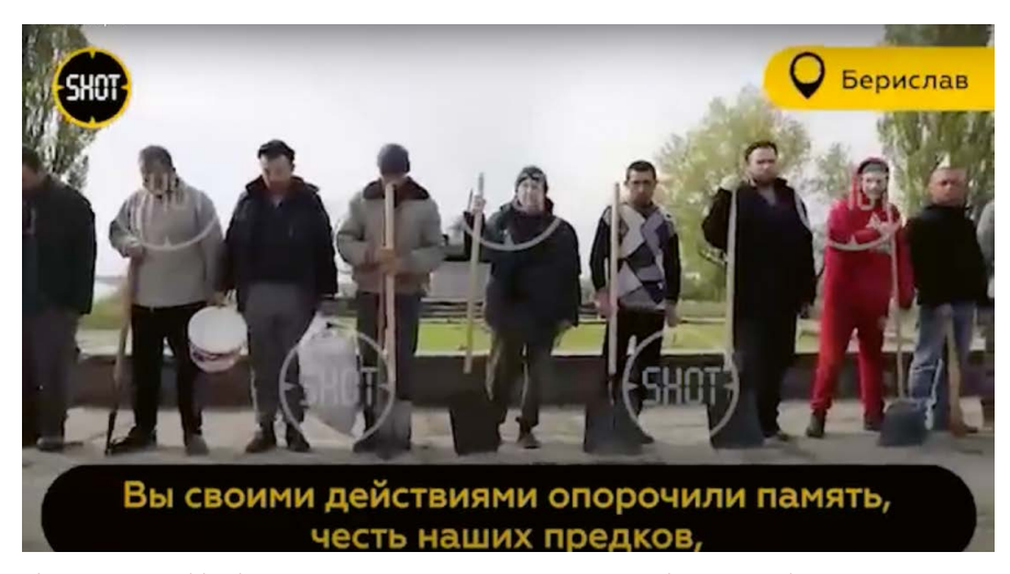
Figure 4.7. Beautification of the area around the Monument to the Liberator Soldiers from the Grateful Residents of Beryslav (Kherson region). A man wearing a Russian army uniform presents the lined up men as Anti-Terrorist Operation participants and says that they "besmirched the memory of their ancestors who fought for our motherland in the years of the Great Patriotic War." Screenshot from a video posted by the Telegram channel Shot , May 4, 2022, t.me/shot_shot/39151.

the above-mentioned case of a supposed former member of the Territorial Defense blowing up an ATO monument, the narrative of a regular local resident awakening from Ukrainian nationalist propaganda was central to the video's message. In another case, a Russian proxy official simply showed a destroyed ATO monument, claiming that it had been demolished by repentant ATO veterans.<sup>111</sup>