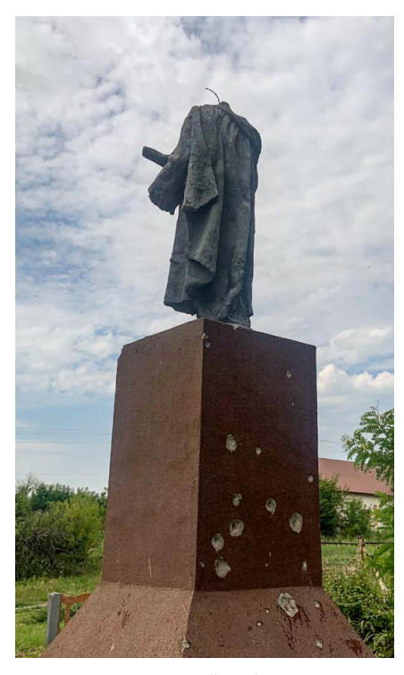
Figure 3.1. Great Patriotic War memorial in the village of Shevchenkove, Mykolaïv region. Photo: Mykola Homanyuk, January 2023.