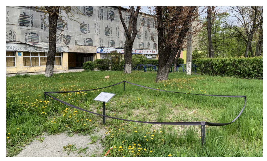
Figure 6.4. Memorial at the explosion site in Babyn Iar in Kyiv. The inscription reads "On March 1, 2022, six persons—five adults and one child—died from a missile attack on Babyn Iar." Photo: Mykola Homanyuk, April 2023.

In some places, improvised standalone memorials marked the spots of Russian attacks. At the Babyn Iar Holocaust memorial site in Kyiv, a new plaque informed visitors that "On March 1, 2022, six persons—five adults and one child—died from a missile attack on Babyn Iar" (see figure 6.4). In Kherson, the sites of the stolen monuments to Admiral Ushakov and General Suvorov were also turned into Ukrainian war