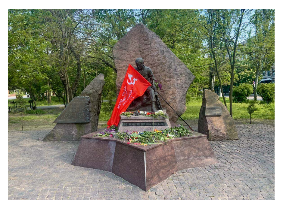
Figure 7.4. Monument to "Internationalist warriors," Kherson. Photo: Mykola Homanyuk, May 9, 2022.

In the invasion, accordingly, the Victory Banner was typically more prominent than other symbols, such as the Russian flag. Copies of the Victory Banner were displayed, alongside other symbols, as an ensign on a wide range of Russian vehicles as they advanced into Ukraine, illustrating the Russian narrative of a struggle against Ukrainian "Nazis" and a repeat of the Great Patriotic War. Russian soldiers installed it at Great Patriotic War memorials.<sup>51</sup> The outwardly Soviet, but essentially post-Soviet, Russian practice of adorning memorials with the banner became hybridized with local folk practices, as exemplified by the Bilozerka, Kherson region, armored vehicle monument where multi-colored farewell ribbons tied to the turret (see chapter 2) coexisted with the Victory Banner. This was documented in a post in a Russian Telegram channel that—ironically—declared that Russian soldiers had "restored the historical look of the legendary Soviet self-propelled vehicle." The Victory Banner was even added to memorials for veterans of the Soviet-Afghan