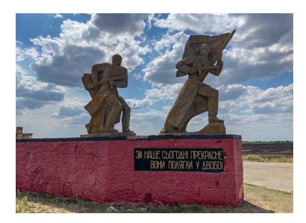
Figures 2.16, 2.17, 2.18. Evolution of polychromy. Great Patriotic War memorial on route M-14 between Melitopol', Zaporizhzhia region, and Kherson. Photos: Mykola Homanyuk, August 2019, May 2021, September 2022.