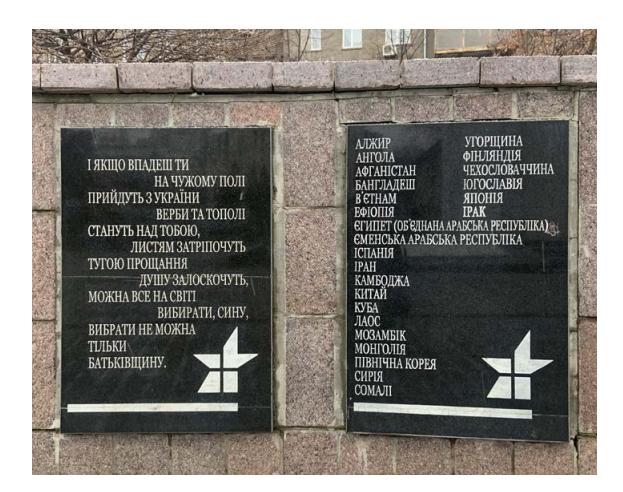
Figure 2.6. Memorial to "internationalist warriors" in Kharkiv.

paigns against Poland, Finland, and Japan; Cold War engagements ranging from Hungary and Czechoslovakia to Korea and Angola; and more recent wars such as those in Iraq and Syria. Separate plaques honor those decorated as Heroes of the Soviet Union or Heroes of Ukraine, regardless of how and when they died—including participants in the wars in Korea and Afghanistan as well as the Anti-Terrorist Operation begun in 2014.