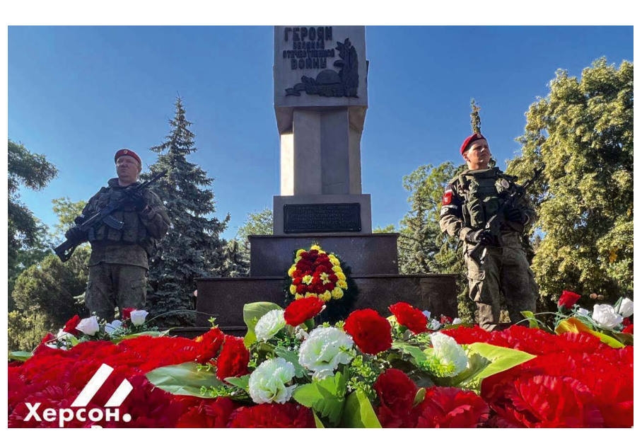
Figure 5.5. Low-angle shot of Russian soldiers in front of a Great Patriotic War memorial in Nova Kakhovka, Kherson region, on the 81st anniversary of the German attack on the Soviet Union.

Figure 5.4. A Russian National Guard soldier participating in monument maintenance, photographed using the golden ratio to position the Z symbol.