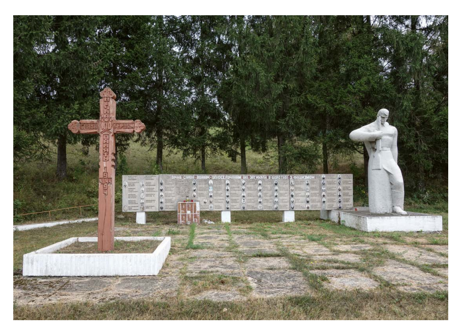
Figure 2.5. A stele (on the left) honoring civilians killed by Ukrainian nationalists during and after WWII was added to a Great Patriotic War memorial from the early 1970s in Rusiv, Ivano-Frankivs'k region. In 1994, a cross was installed to commemorate all the fallen of the Second World War. Photo: Matthias Kaltenbrunner, September 2019, published with permission. <sup>16</sup>

to the more recently dead in the vicinity of Great Patriotic War memorials, local residents sometimes add their names directly to existing monuments or redesign them to commemorate different conflicts equally despite the very different status that they have in public memory.