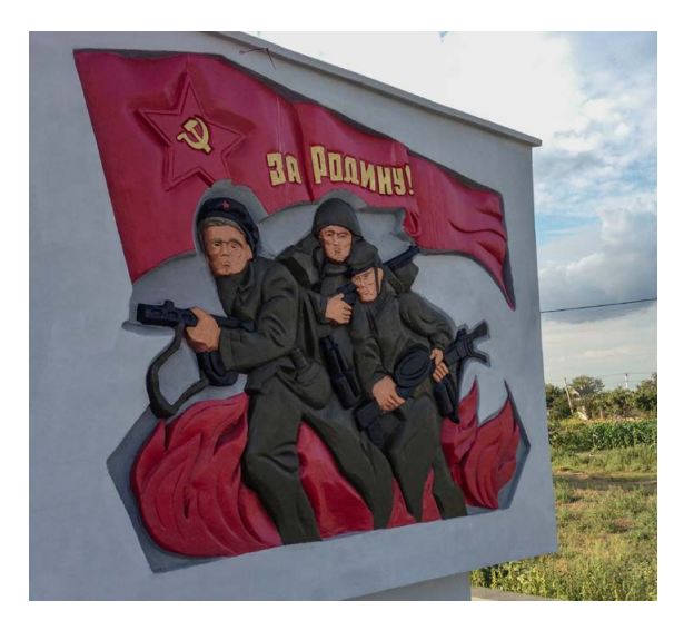
Figure 2.10 (top left). Great Patriotic War memorial in the village of Kruhloozerka, Kherson region. Photo: Mykola Homanyuk, July 2017.

blue-and-yellow colors of Ukraine's flag. At other times it involves adding a trident, a flagpole with the Ukrainian flag (or even the black-and-red flag of the 1940s Ukrainian Insurgent Army), changing the inscription (from