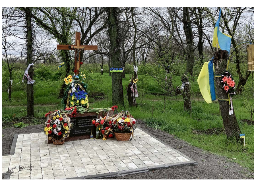
Figures 6.7. Memorial to fallen members of the Territorial Defense forces. Lilac Grove, Kherson.