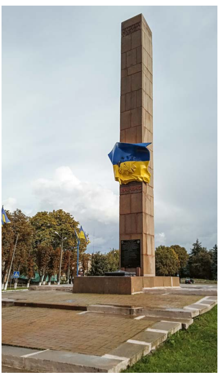
Figure 2.12 (bottom right). Great Patriotic War memorial in the Andriïvka municipality, Zhytomyr region.