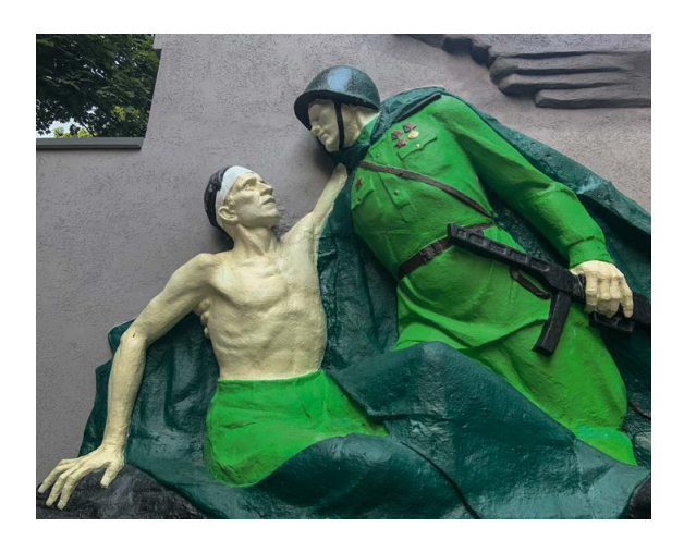
Figure 2.9. Great Patriotic War memorial in Volnovakha, Donets'k region. Photo: Mykola Homanyuk, August 2020.

pointed stars, decorative urns, medals, flowers or wreaths, letters, or other protruding elements. Some monuments are entirely covered in paint of five to seven different colors, creating a color scheme reminiscent of comic books, lawn ornaments, or ceramic figurines or toys. <sup>33</sup> A related set of vernacular practices of adding color takes up the eternal flame motif, imitating a flame in the absence of gas, for example through the use of candles in red glass holders or flame-shaped sheets of red or orange paper or plastic. <sup>34</sup> Still other practices go beyond commemoration. Thus, in Bilozerka in the Kherson region, young women regularly wrapped colored ribbons around the barrel of a Great Patriotic War self-propelled artillery vehicle monument when seeing their boyfriends off to army duty.