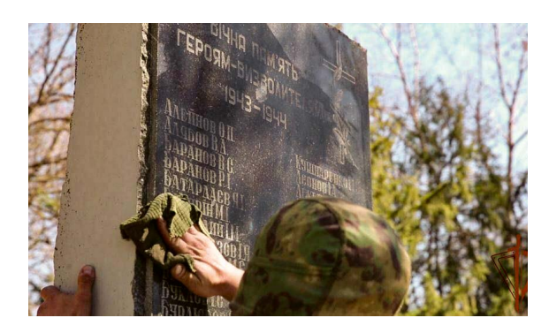
Figure 5.6. A Russian soldier wiping a list of World War II participants with a piece of cloth. A common motif in videos and photos from the first months of the invasion.

tive ceremonies,<sup>32</sup> though in some cases the purpose seems to be simply to show the entire group rather than the memorial itself.<sup>33</sup> A related mode of wide-angle presentation was to show Russian soldiers guarding memorials from imaginary attackers while they were being renovated.<sup>34</sup> In April 2022, the proxy administration of Kherson posted a set of professional photographs showing masked soldiers in full assault gear in front of a memorial, with the caption "The special operations forces of the Russian National Guard in Kherson defended a memorial to those who fell in the Great Patriotic War."<sup>35</sup>