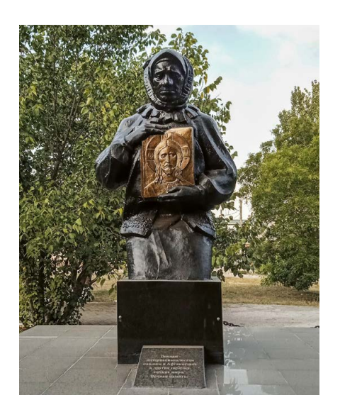
Figure 4.6. Monument to "Internationalist warriors who fell in Afghanistan and other global hot spots," Kherson. Photo: Mykola Homanyuk, August 2022.

painting large red carnations with green stems on a Great Patriotic War memorial.<sup>96</sup> The star-shaped base of an eternal flame in Lazurne, Kherson region, was repainted red.<sup>97</sup>