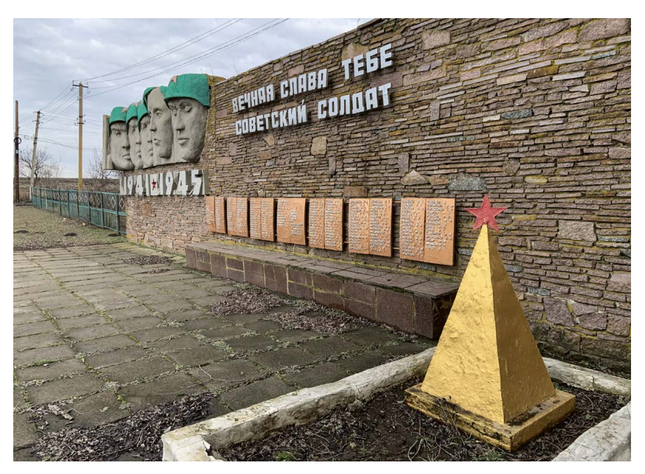
Figure 2.4. Great Patriotic War memorial in the village of Serhiïvka, Dnipropetrovs'k region, with a monument erected soon after the war and a larger one from the 1960s. February 2020.

cial to the formation of a USSR-wide cult of the Great Patriotic War in the 1960s,<sup>4</sup> which led to many of the earlier monuments being replaced by somewhat more standardized memorials (though occasionally the old ones remained; see figure 2.4). There is not a single hromada (urban or rural municipality) in Ukraine, including places founded after 1945, that does not have at least one memorial to the World War II dead, commemorating local soldiers and civilians as well as soldiers from other parts of the Soviet Union who died defending or liberating the area, and ranging from small obelisks to larger-than-life bronze statues. Not least of all,