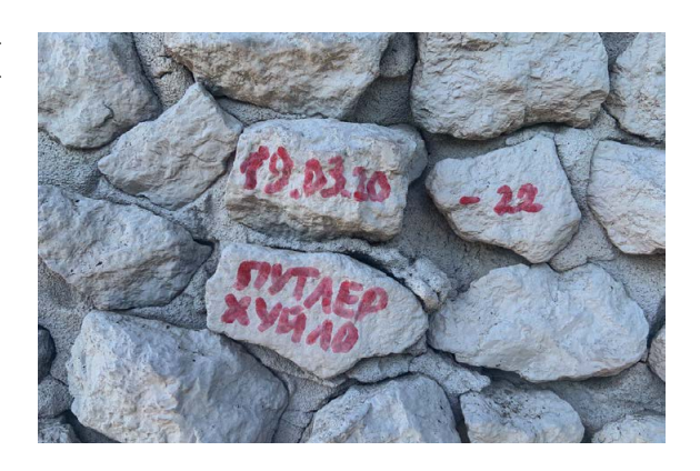
Figure 6.1. Danube Fleet monument in Kherson with graffiti "Putler is a dickhead." Photo: Mykola Homanyuk, March 2022.

Flags—both painted and cloth—were among the main symbols of defiance. The tank monument at the entrance to Kherson's Park of Glory can serve as an example. A Ukrainian flag was installed on it on February 24, the first day of the invasion. On March 13, during one of the largest antioccupation demonstrations in the city, someone put up several such flags on the tank, including a large one on which demonstrators signed their names. The flags were only taken down by the occupation administration at the end of March, as was the Ukrainian flag attached with adhesive tape to the polymer kneeling soldier statue of one of Kherson's Soviet-Afghan War monuments.<sup>4</sup>