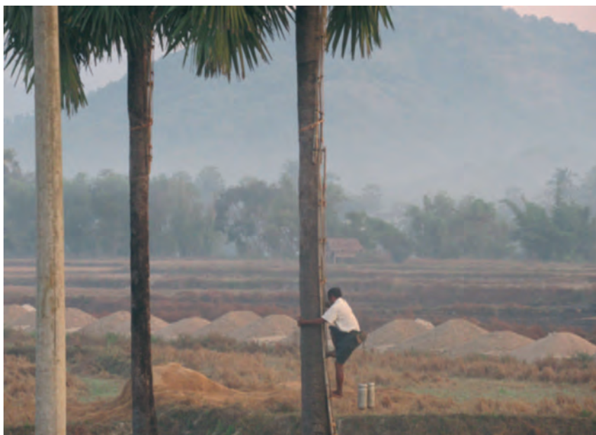
Figure 8.4. 'Money from nature.'