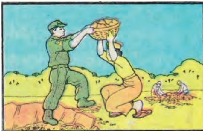
Figure 3.2. Kindergarten Myanmar Reader (2009) showing male soldier and female civilian carrying rocks.