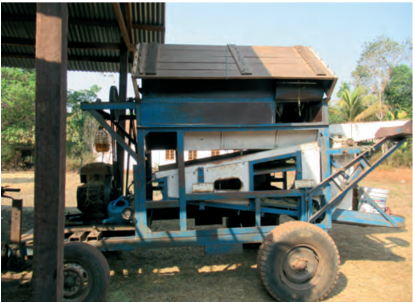
Figure 8.2. ‘[Threshing] rice with the machine. It is easy and we won’t be tired.’