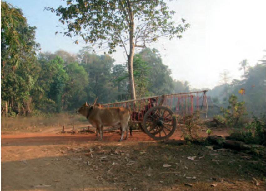
Figure 8.1. ‘We will go harvest the rice and collect the hay.’