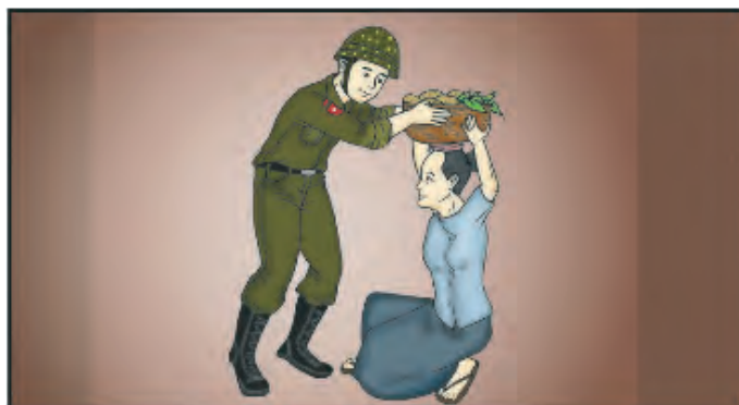
Figure 3.3. First Grade Myanmar Reader (2017) showing male soldier and female civilian carrying vegetables.