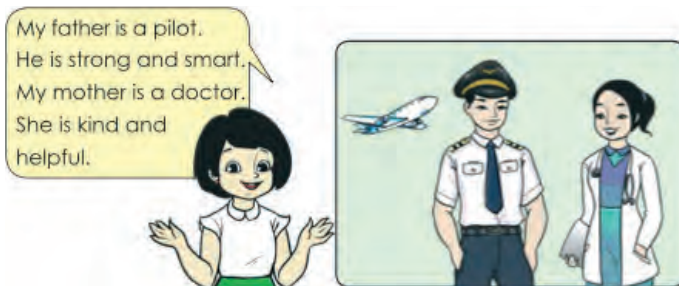
Figure 3.1. Third Grade English textbook (2019) showing male pilot and female doctor.