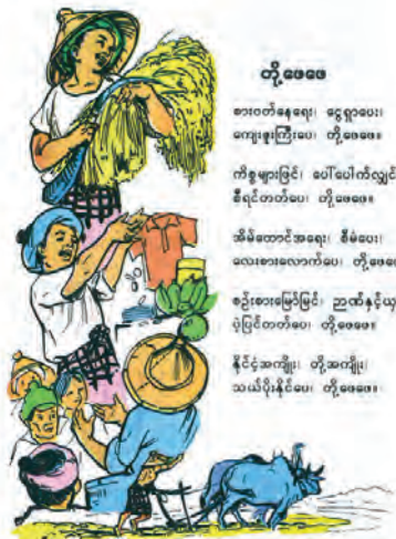
Figure 3.10. Second Grade Myanmar Reader (2016) showing poem 'Our Daddy'.