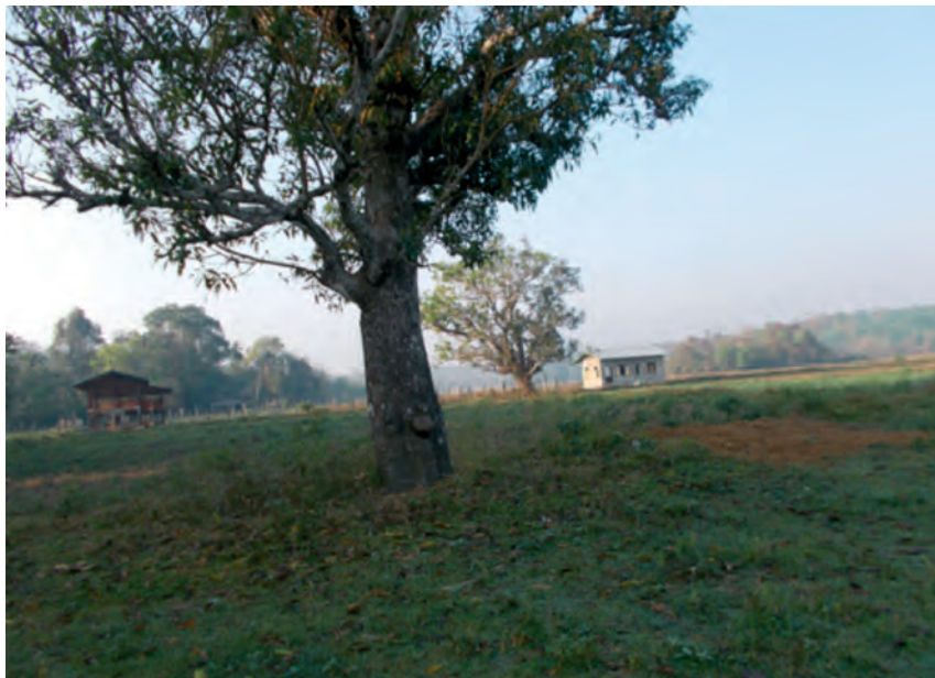
Figure 8.3. 'The new village to come.'