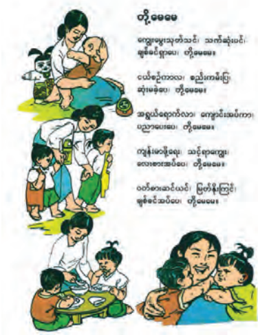
Figure 3.9. Second Grade Myanmar Reader (2016) showing poem 'Our Mummy'.