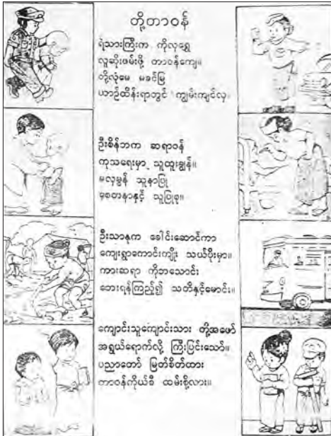
Figure 3.14. Second Grade Myanmar Reader (2007) showing poem ‘Our responsibilities’.

occurs repeatedly in textbooks. This image is expanded upon in the third-grade geography and history textbook (Myanmar MOE 2007a: 4–11), where photographs of these couples appear on sequential pages alongside the characteristics of each group. In this sequence, ‘gender harmony’ and what could be called ‘ethnic harmony’ (in which ethnic groups also play parallel yet unequal roles, with Burmans leading and other ethnicities following) are fused to offer a vision of Myanmar society in which ethnic groups and genders peacefully coexist.