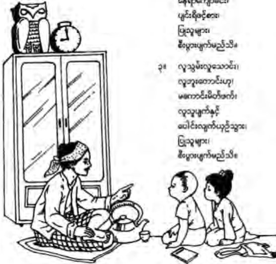
Figure 3.12. Third Grade Myanmar Reader (2016) showing male figure giving moral instruction to male and female children.

၃။ လူသွမ်းလူသောင်း၊ လူအားတောင်းဟု၊ မကောင်းမိတ်ဖက်၊ လူသူမျှော်နှင့် ခေါင်းလျှက်ယှဉ်သွား၊ ပြုသူများ၊ စီးပွားပျက်မည်သိ။