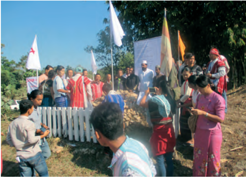
Figure 8.5. ‘Because I don’t want it to go extinct.’

I draw on photovoice data from two of our research sites in the southeast of Myanmar: Kawkareik in Karen State and Dawei in Tanintharyi Division. My discussion of the images is informed not only by the women’s explanations of them and by our interviews and analysis for the project, but also by an additional 26 months I spent conducting ethnographic fieldwork on agrarian change and land politics in Myanmar.