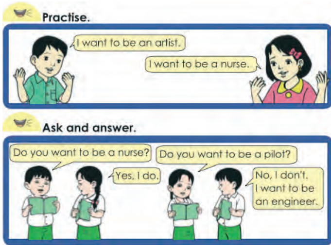
Figure 3.4. Second Grade English textbook (2018) showing a girl's ambition to be a nurse.