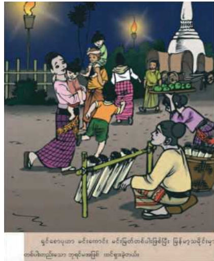
Figure 3.6. Second Grade Social Studies textbook (2018) showing Queen Shinsawpu's rule.