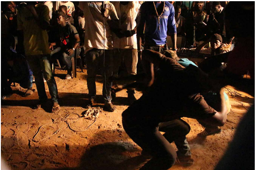
Figure 4.9 Jakarlo, Sanchaba Gambia, 2016. The opponents compete through dance.