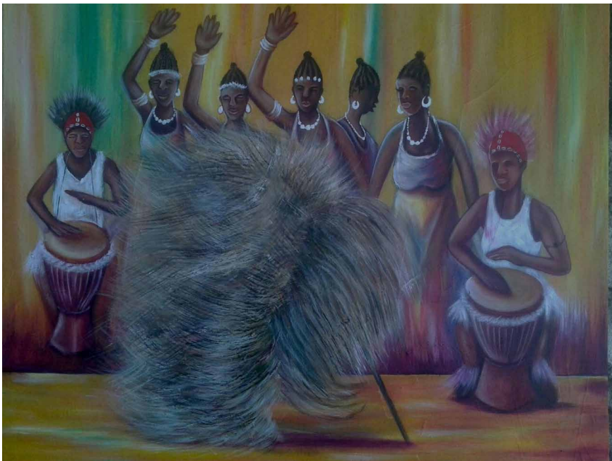
Figure 4.3 'Kumpo Dance' Omar Corr – Acrylic on canvas, 2015. Image courtesy of the artist.

Omar Corr has also decided to stay home and paint. He is the author of the painting titled 'Kumpo Dance' (Figure 4.3) and is very much aware of the significance of the central character being the 'Kumpo' in his work. Traced to the Cassa subgroup among the Jola tribe, the 'Kumpo Dance' is also a festival where traditions of protection and initiation rituals occur. Its popularity was visible in the Fonyi district of the Casamance region of Senegal, and despite the varying discourses on the origin and significance of the dance, the negotiation of political and economic power relations, gender disputes and conflict resolution at the local village level are consistent characterizations of the role of the 'Kumpo Dance', which is to facilitate social cohesion and control. 37 The Kumpo's relevance to young people in The Gambia is noted because of the role played in mediating family issues and renegotiating relationships, such as loss of parental control as a result of young men engaging in seasonal labour migration. 38