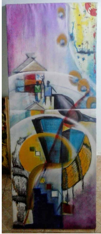
Figure 4.4 'The Network' Pa Douullo Kandeh – Acrylic on canvas, 2015. Image courtesy of the artist.

addresses the nuanced ways in which social relations are being reshaped, in the context of a condensing network society these relationships pose their own set of risks that potentially destabilize youth social structures. These youth instabilities are often driven by, but not always confined to, poverty reduction strategies but also through perceived educational and economic opportunities abroad. 52 Aspirational desires instigated through migration as a symbol of success challenges the fluidity of young people's national identity, especially when they change or take on alternative nationalities to travel across borders. 53 Expressions of educational aspirations also serve as assertions of new identity formation; however, the migration of young people increases the risk of brain drain. 54 As Castels and Miller argue, decreasing labour forces of skilled and unskilled migrants is a concern for processes of external and intercontinental migration across Africa. 55 Aspirations to travel abroad occur through a