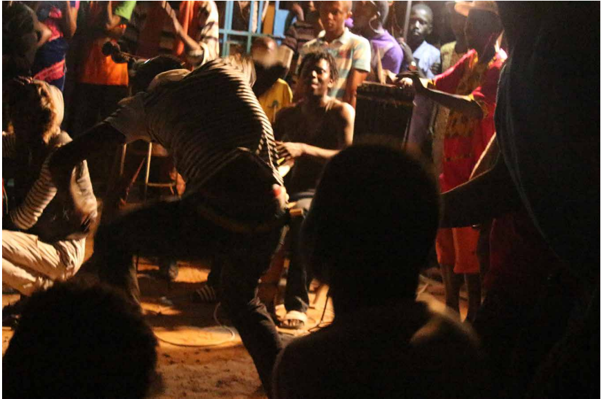
Figure 4.8 Jakarlo, Sanchaba Gambia, 2016. The opponents compete through dance.