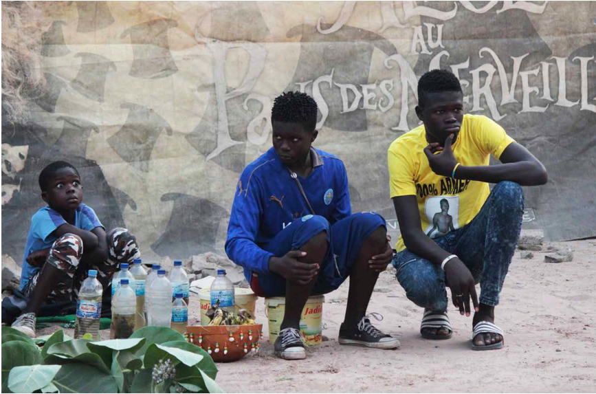
Figure 4.5 Jakarło, Sanchaba Gambia, 2016. Boys guarding substances held in plastic bottles, jars and calabash.