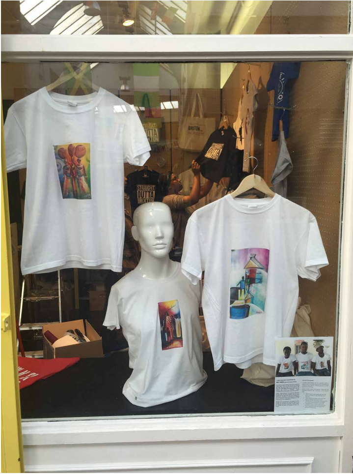
Figure 4.1 a and b ArtFarm members model products (a, above) on display at London's youth social enterprise Hustlebucks, 2015 (b).

The Mandinka phrase, 'Jamba Dogo' (dancing leaf or the leaf dancing), shown in Figure 4.2, is the spirit and title of Keba Salah's painting, in which he draws upon and emphasizes the importance of his choice of colour pallet to reflect the vibrant attire worn during traditional festivities. Keba turns his focus on how best to capture movement, whilst pointing to the floating dust beneath the brightly clothed people's feet. He explained that he is inspired by some of the moves performed during the opening and closing of the local wrestling matches he attends, in order to capture an old cultural dance which often took place during local festivals for male circumcision or after a fruitful harvest, whilst listening to the Spirit of Nature albums. Keba had not long returned from