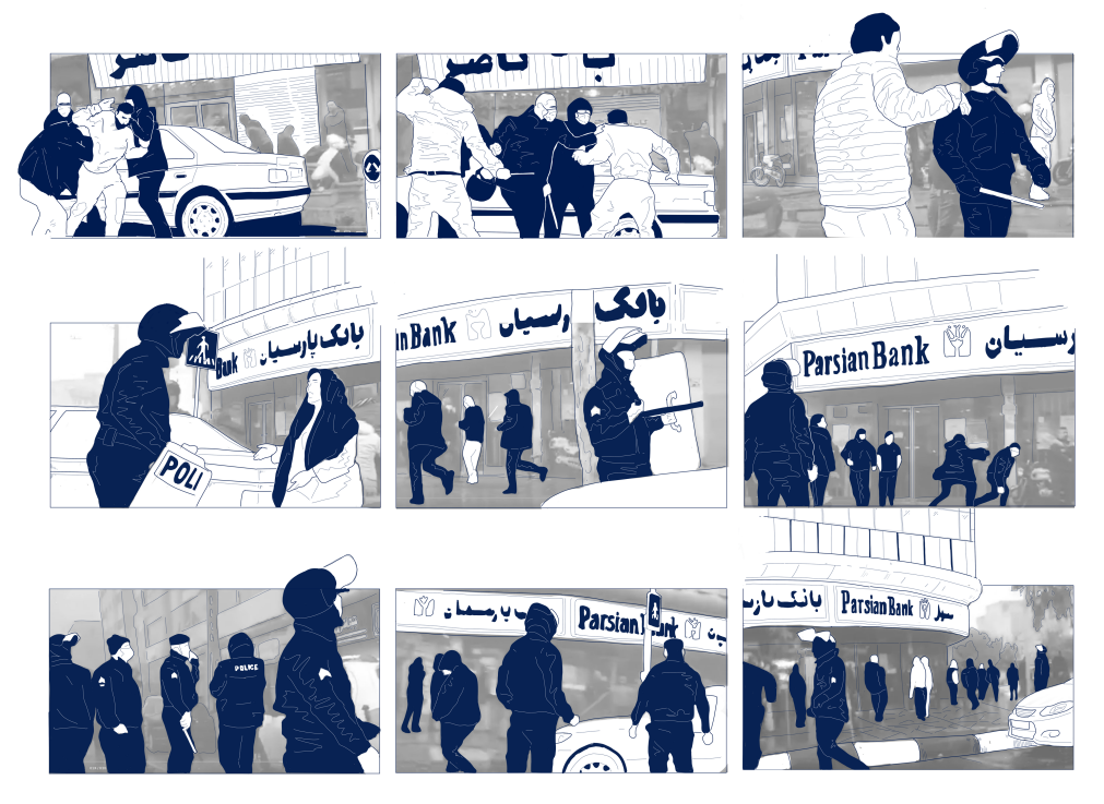
Figure 23.4 Protest in Sattarkhan Street, Tehran, Iran, in November 2019, based on video footage posted by BBC. Diagram by Jamikorn Charoenphan © Farzaneh Haghighi.

shooting occurred. And in doing so, architecture and urban space give visibility not only to the contained and controlled crowd of people but also to the violence imposed on them. In other words, architecture gives a form to spatial violence.<sup>71</sup>