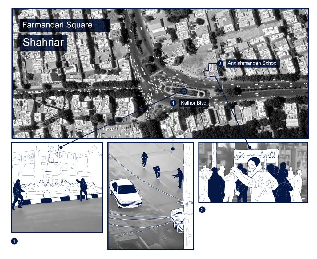
Figure 23.2 Spatial analysis of video footage based on the works of human rights activist Justice for Iran, derived from Shoot to Kill. Providing evidence that police shot directly at an unarmed protestor. Diagram by Jamikorn Charoenphan © Farzaneh Haghighi.