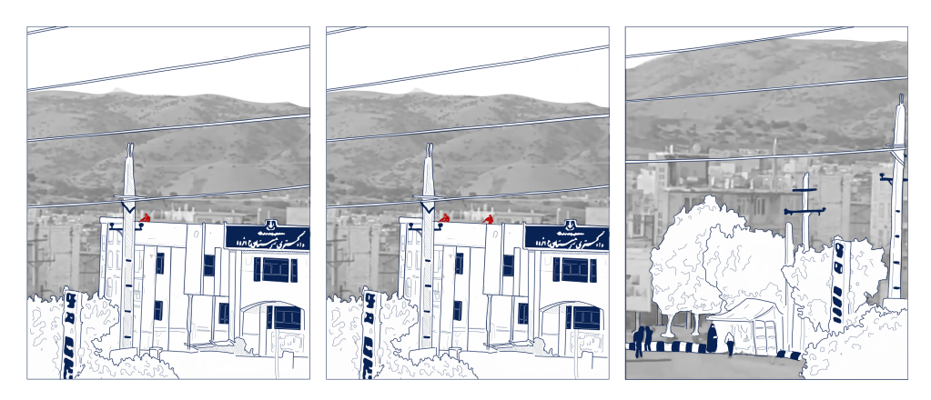
Figure 23.3 Individuals stationed on the rooftop of a governmental building, the Justice Department, using firearms against the protestors in the street below in Javanroud, Kermanshah, November 2019, based on video footage posted on YouTube by Freedom Messenger and Nazeran R.F.I. Diagram by Jamikorn Charoenphan © Farzaneh Haghighi.